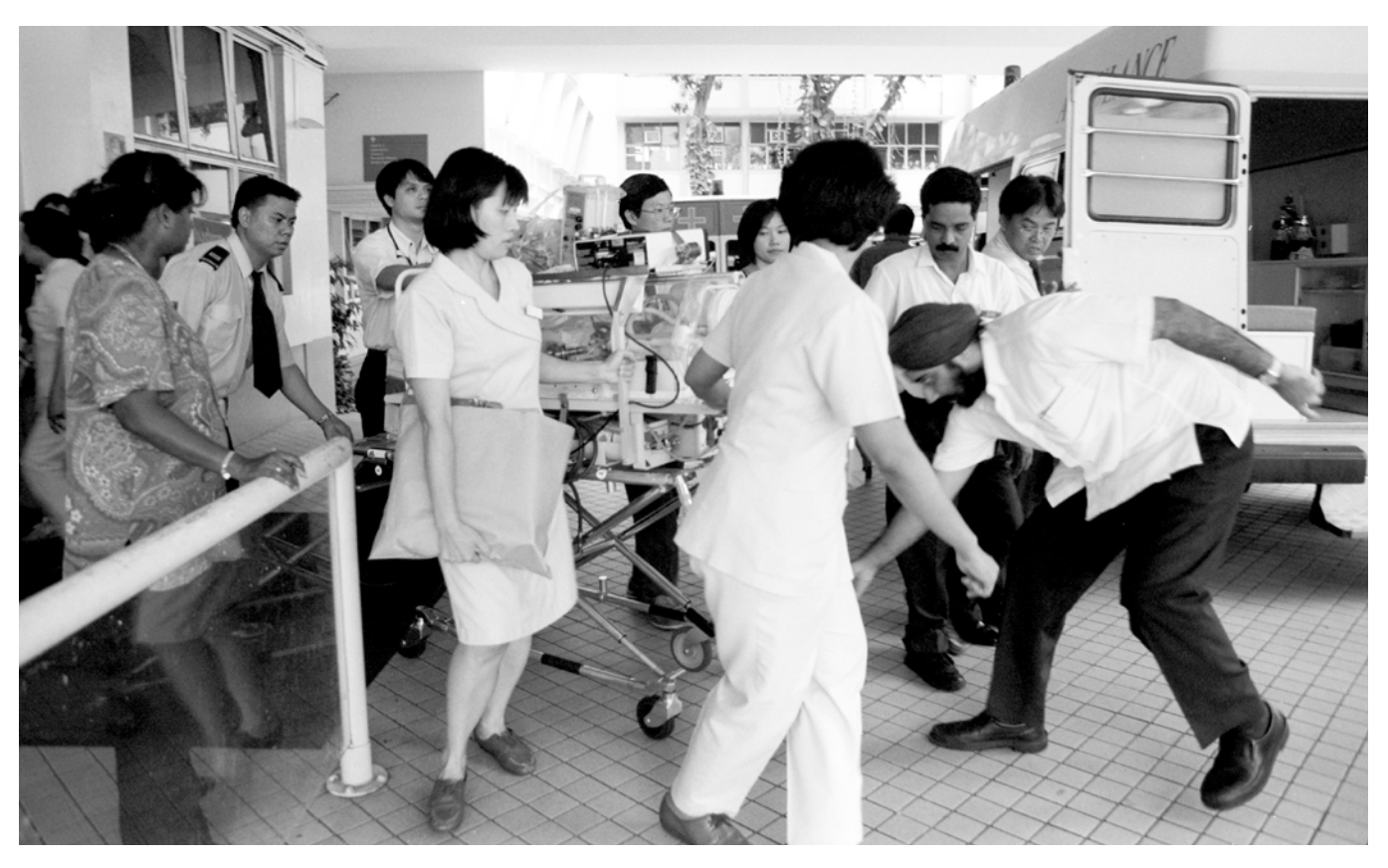
Transfer of premature and neonatal babies from Kandang Kerbau Hospital to the new KK Women's and Children's Hospital on the last day of operations at the old hospital, 1997.

his team delivered Asia's first "test-tube baby", a baby conceived through in-vitro fertilisation, at KK Hospital. Three years later, he and his team of doctors also helped to deliver the first baby in Asia born from gamete intrafallopian transfer (GIFT), which involves a direct transfer of the sperm and egg into the fallopian tube.