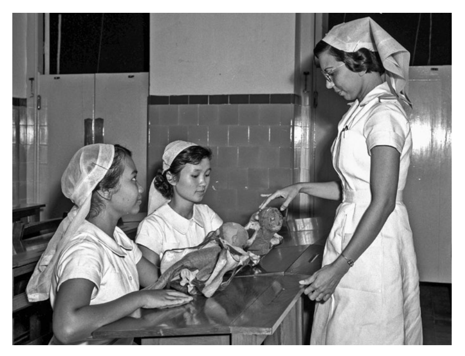
Learning how to handle newborn babies at the Kandang Kerbau Hospital, 1958.

The baby boom continued unabated until the effects of the national family planning campaign, launched in 1960,