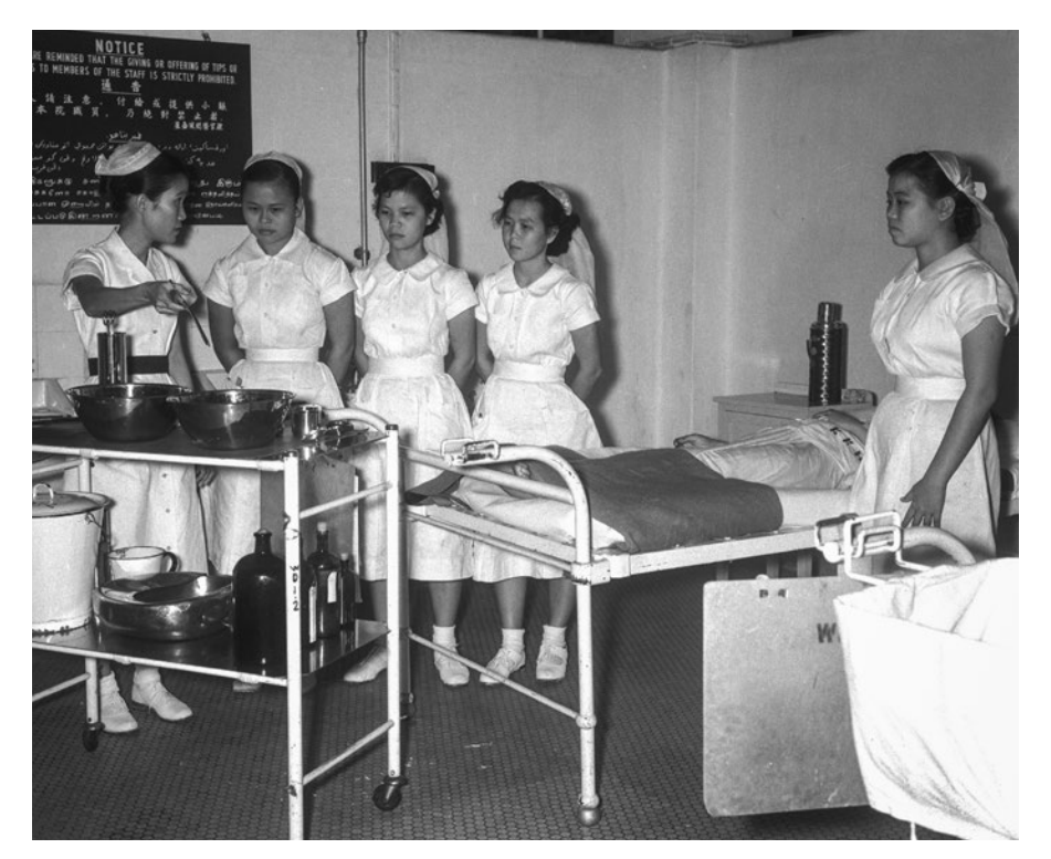
Undergoing training at the Kandang Kerbau Hospital, 1958.

ancillary departments", renovations to the existing wings and the addition of buildings to eventually increase bed capacity to 590, up from 240.17