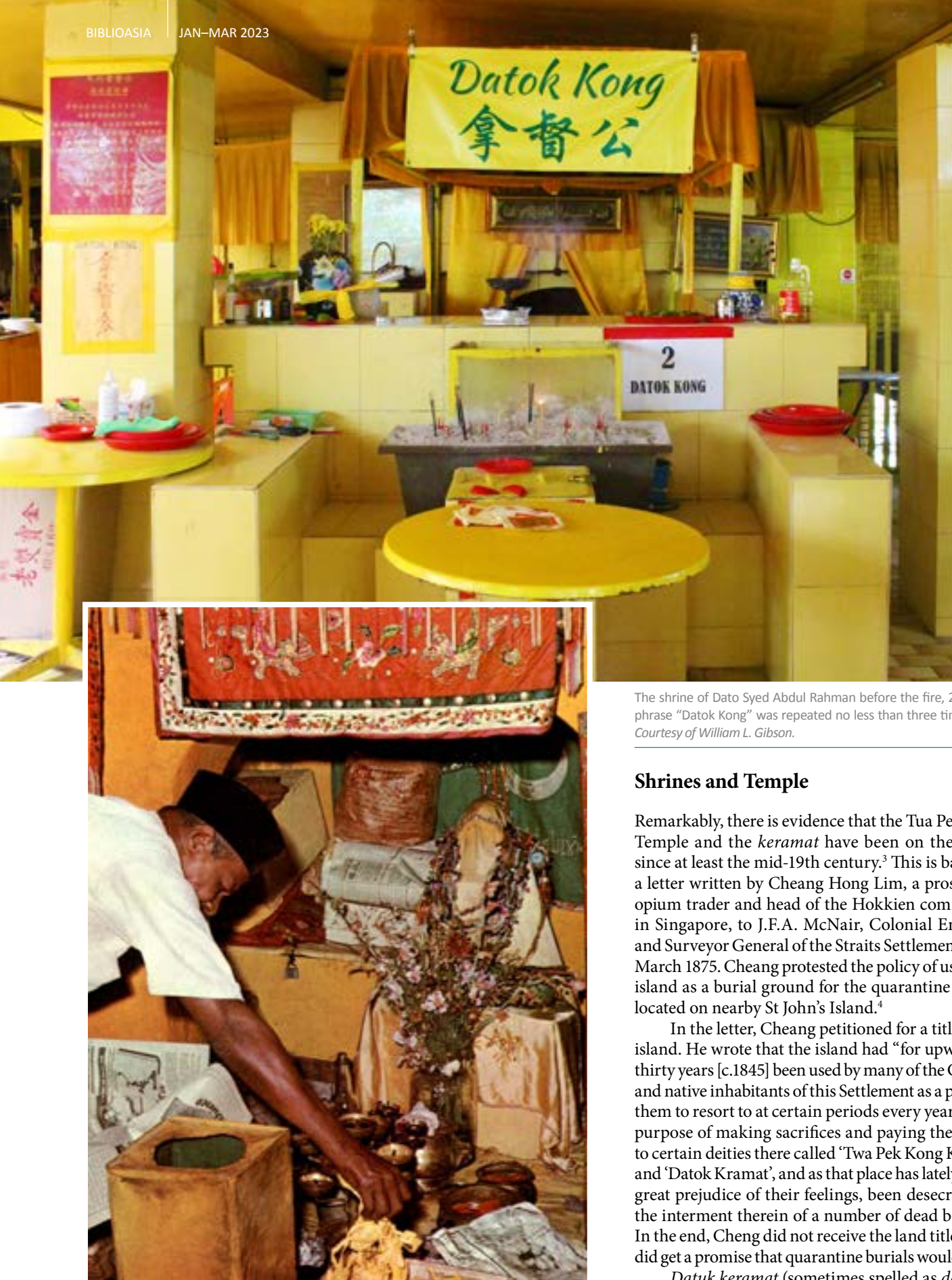
The Malay caretaker placing offerings from devotees at Dato Syed Abdul Rahman's shrine, 1970. Image reproduced from Goh Tuck Chiang, "Picnic With the Harbour Gods," Straits Times Annual, 1 January 1970, 66–67. (From NewspaperSG).

The shrine of Dato Syed Abdul Rahman before the fire, 2022. The phrase "Datok Kong" was repeated no less than three times here.