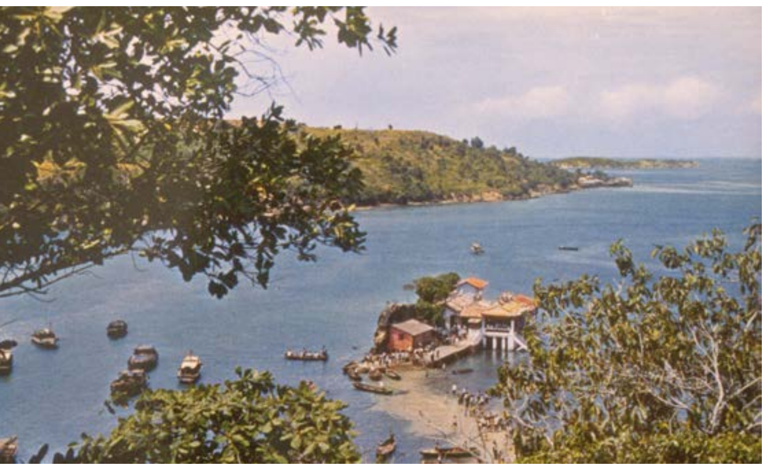
View of the Tua Pek Kong Temple from the keramat at the top of the hill, 1969. This was before reclamation works in the 1970s.