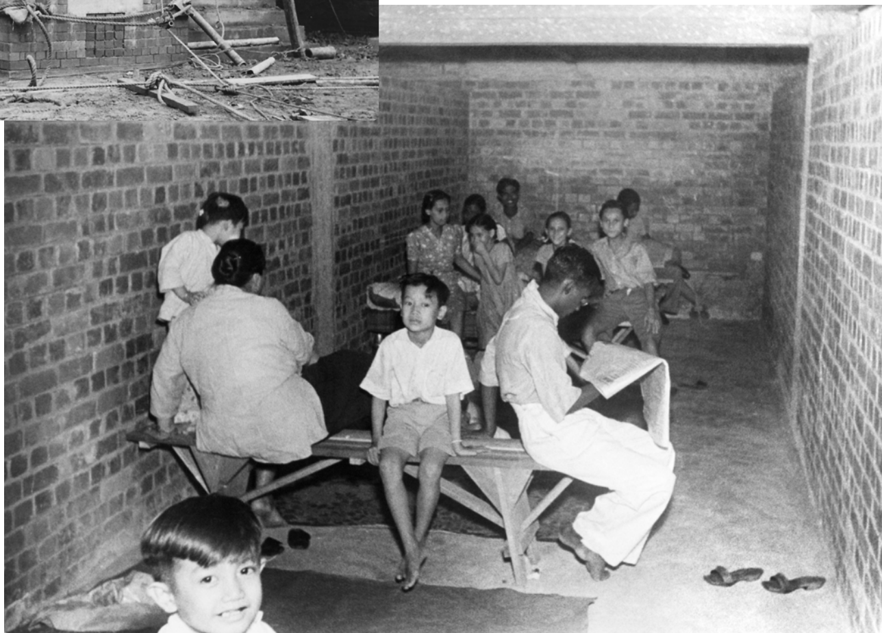
(Right) Civilians in an air raid shelter during a Japanese bombing raid, December 1941. ©Imperial War Museum (KF 102).