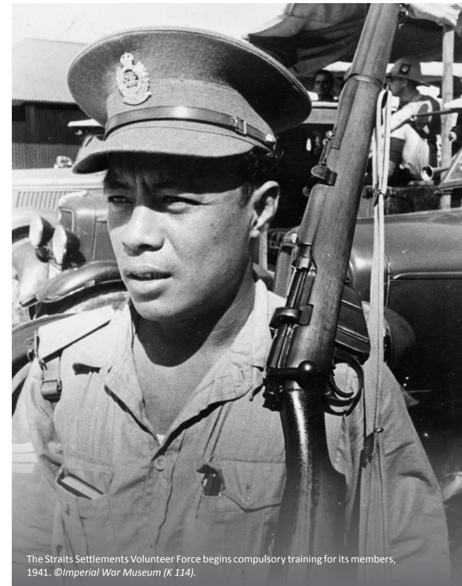
The Straits Settlements Volunteer Force begins compulsory training for its members, 1941. ©Imperial War Museum (K 114).