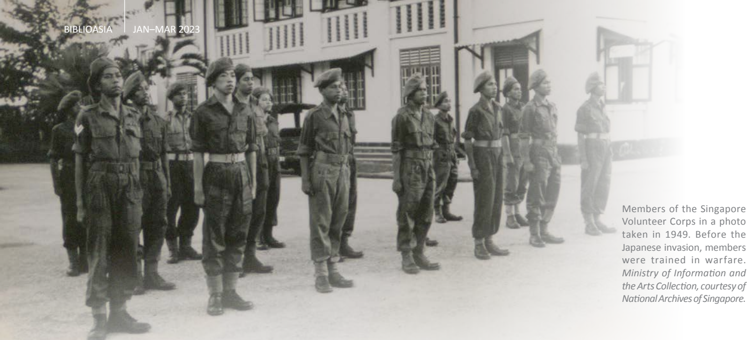
Members of the Singapore Volunteer Corps in a photo taken in 1949. Before the Japanese invasion, members were trained in warfare.