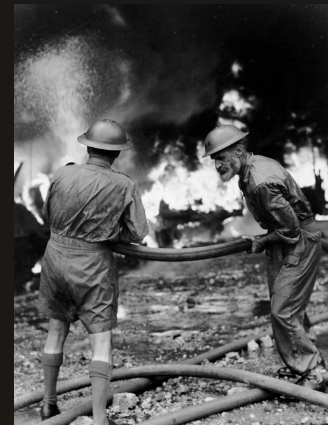
Volunteers of the Air Raid Precautions fighting fires at the docks in Singapore, c. January 1942.