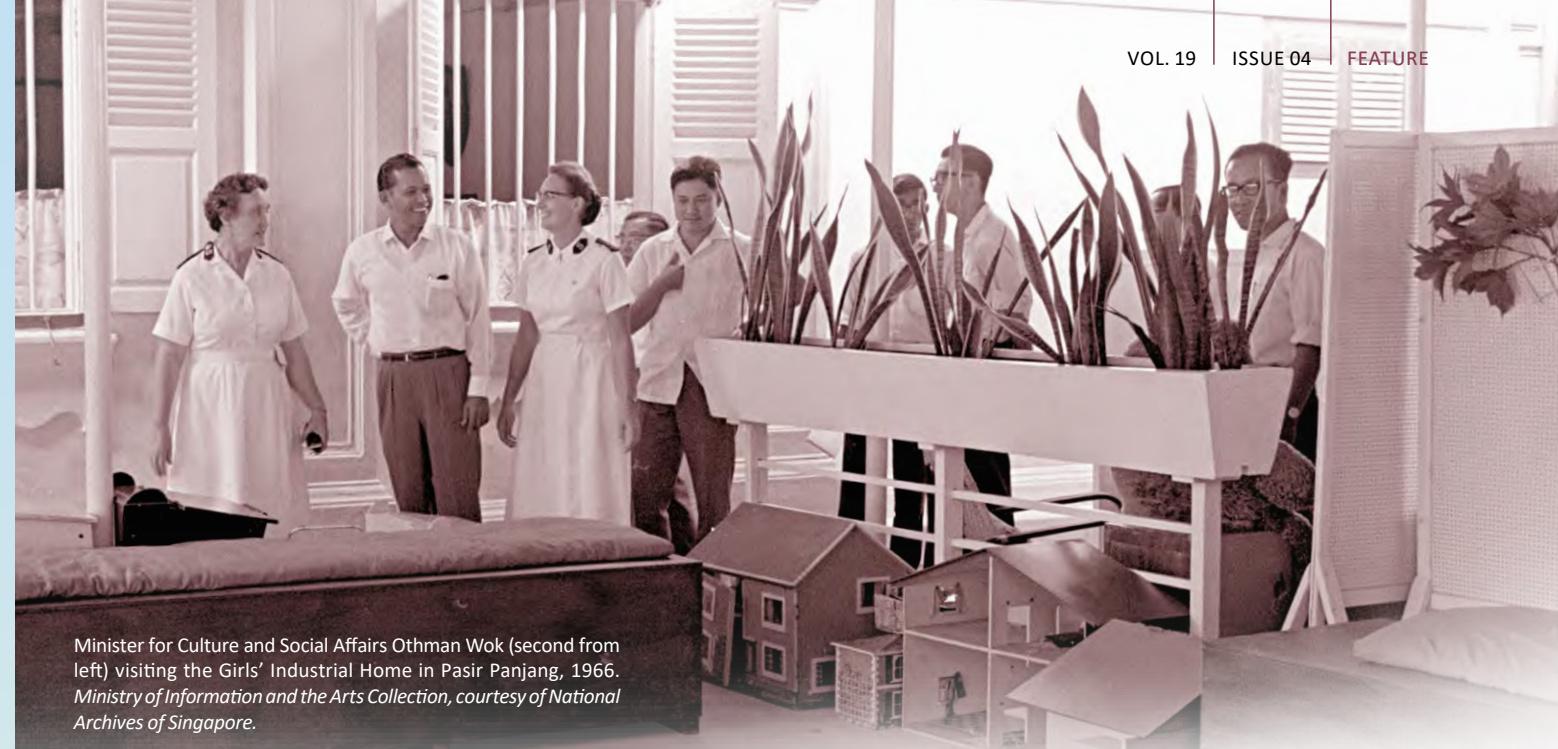
Minister for Culture and Social Affairs Othman Wok (second from left) visiting the Girls' Industrial Home in Pasir Panjang, 1966.