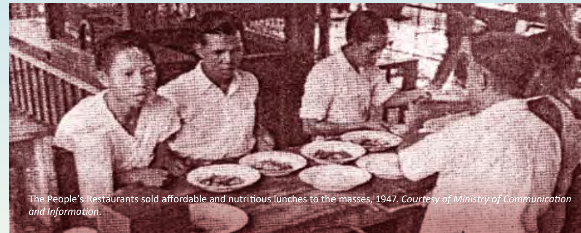
The People’s Restaurants sold affordable and nutritious lunches to the masses, 1947.

Today, the Salvation Army in Singapore runs a host of programmes for children and youth, the elderly, migrant workers, former prisoners and the general community. It runs Gracehaven, a children’s home; the Peacehaven Nursing Home; Carehaven, a shelter for foreign domestic workers; and a few thrift stores around Singapore. ♦