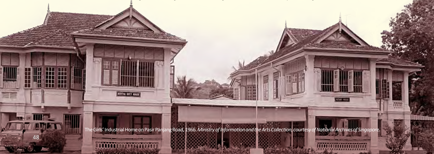
The Girls' Industrial Home on Pasir Panjang Road, 1966.