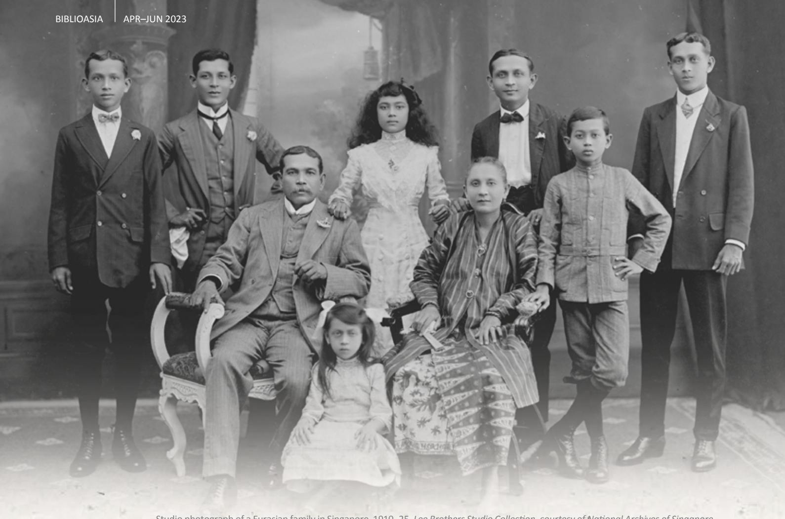
Studio photograph of a Eurasian family in Singapore, 1910–25.

creole in Melaka. Many Dutch men ended up marrying Creole-speaking Eurasians and had Creole-speaking slaves of Portuguese descent. 11 Despite being unrelated to the Portuguese, these slaves were known as Black Portuguese (Zwarte Portuguessen) and later Mardijkers (from Malay merdeka, which means "free men", as they were "free" from taxes. The word merdeka is in turn derived from marhardika, Sanskrit for "freedom").12