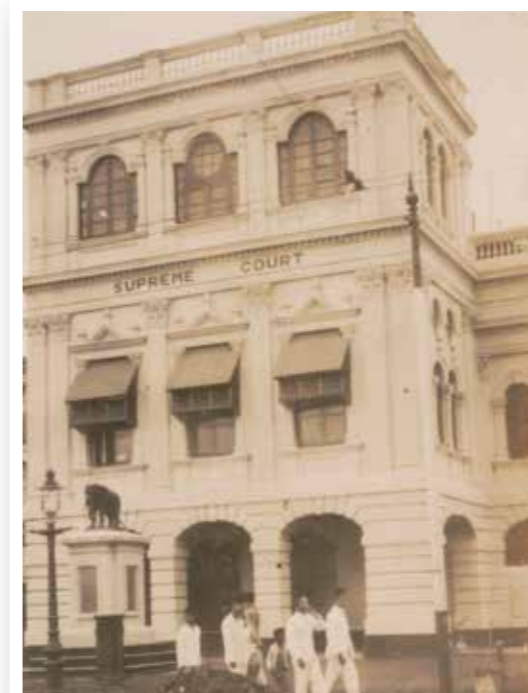
The Supreme Court remained in Maxwell’s House (pictured) until 1939 when it moved to the newly built Supreme Court building at the junction of St Andrew’s Road and High Street.

At this point, the Treaty of Friendship and Alliance established that insofar as the British factory was concerned, the British would have jurisdiction