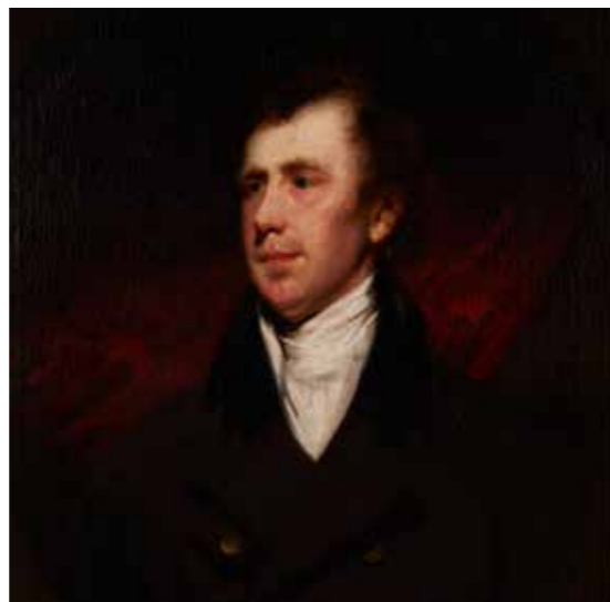
Portrait of Robert Fullerton, Governor of the Straits Settlements, by George Chinnery, early 19th century. Fullerton opened the first criminal hearing (session of Oyer and Terminer and Gaol Delivery) and presided over the first-ever Court of Judicature of the Prince of Wales Island (Penang), Singapore and Melaka held in Singapore on 22 May 1828. Collection of the National Museum of Singapore, National Heritage Board.

In respect to arrangements at Singapore and Malacca for the accommodation of the Recorder and Court, it may be necessary to mention that the former being a place recently established not