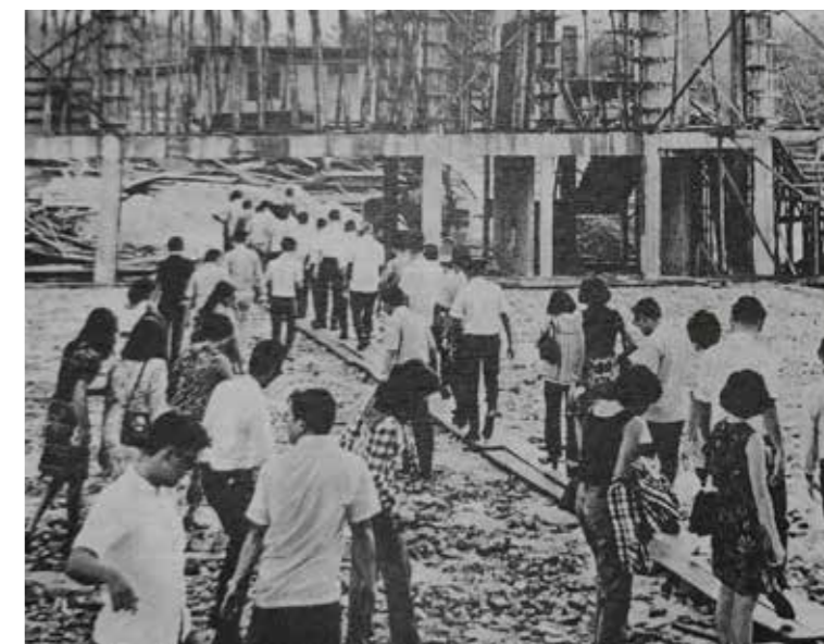
Teachers visiting the Teachers' Centre construction site, 1972.

To raise money, the STU launched a series of fundraising activities from October 1972. The aim was to raise $150,000 (30 percent of the estimated