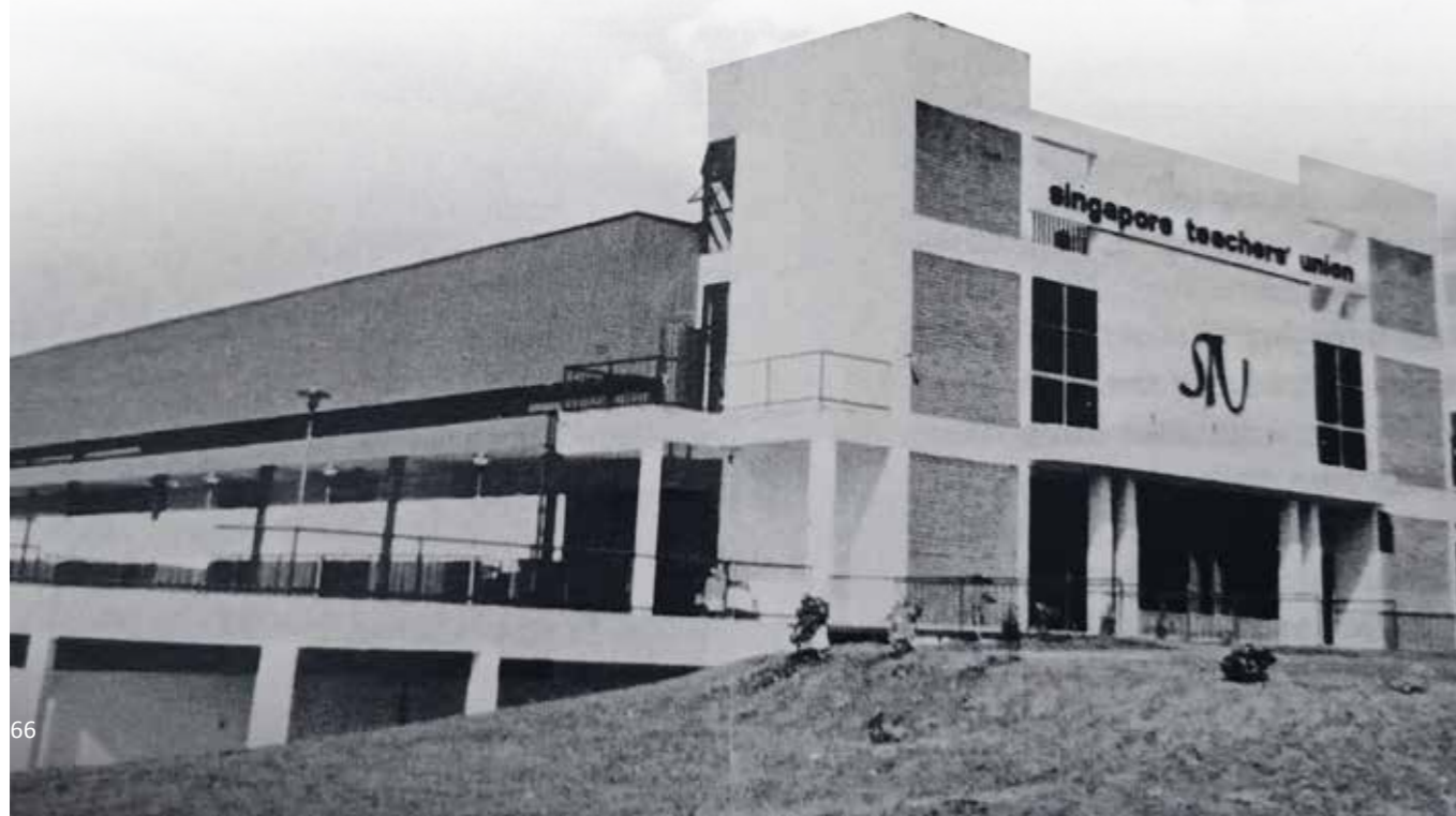
The Teachers’ Centre, 1975. Image reproduced from Mentor vol. 5, no. 1 (1975) (Singapore: Singapore Teachers’ Union, 1971–), 10.

retains the charm of a quaint and rustic neighbourhood. As a writer for a property website noted: “Although I could see that many of the houses are old – they still boast the original architecture... [b]ut they do not look rundown and the estate feels both comfortable and well-loved.” 38