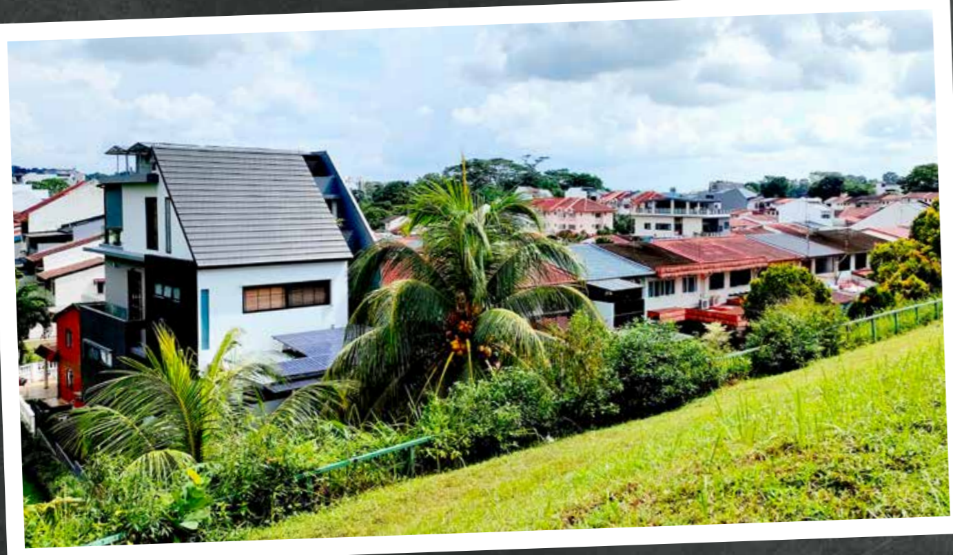
A view of the Teachers' Housing Estate from the bustop on Yio Chu Kang Road.

The Singapore Teachers' Union wanted a clubhouse. It ended up building a housing estate. By Sharon Teng