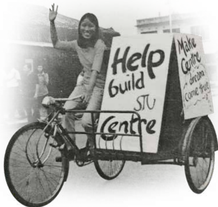
The “trishawthon” event helped raise funds for building the Teachers’ Centre, 1973. Image reproduced from Mentor vol. 5, no. 1 (1975) (Singapore: Singapore Teachers’ Union, 1971–), 14.

cost for phase one) for the clubhouse, which would be called the Teachers’ Centre. 30 One of the activities in February 1973 was a “trishawthon”, which raised $34,671. 31 The STU also appealed to teachers to donate to the clubhouse fund and over 300 teachers pledged a total of $35,540. In 1973, the union received a $100,000 loan from the government. 32