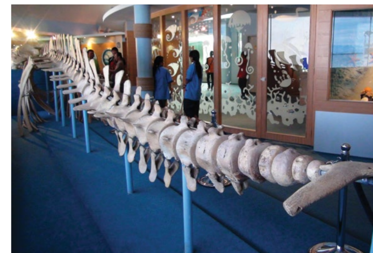
The blue whale skeleton that had been in Singapore for nearly a century and later gifted to the National Museum of Malaysia in 1974 is now on display at the Labuan Marine Museum, off Sabah. Courtesy of Shih Hsi-Te. Images reproduced from Martyn E.Y. Low and Kate Pocklington, 200: Points in Singapore’s Natural History (Singapore: Lee Kong Chian Natural History Museum, 2019), 478–79. (From National Library, Singapore, call no. RSING 508.5957 LOW).