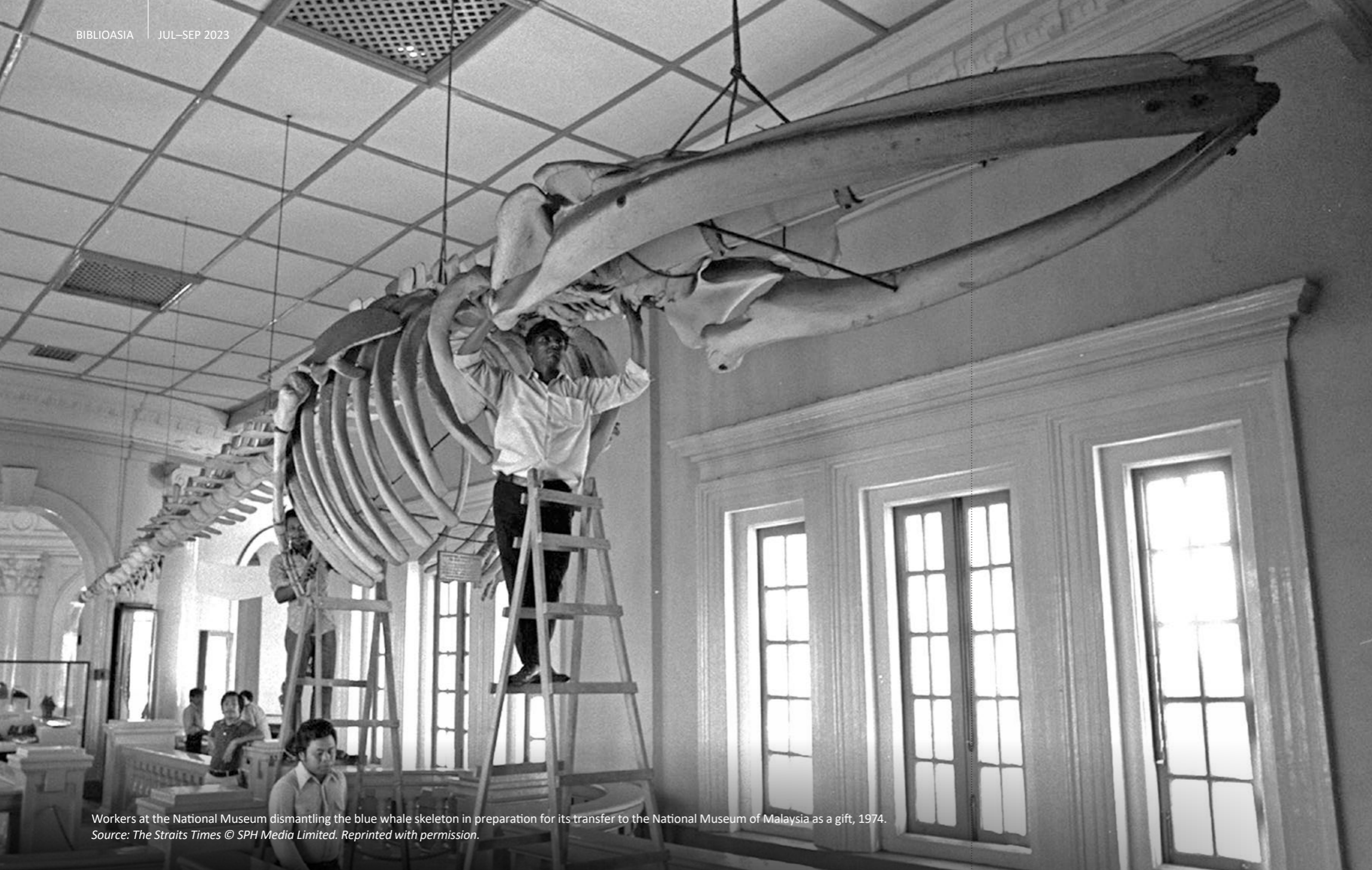
Workers at the National Museum dismantling the blue whale skeleton in preparation for its transfer to the National Museum of Malaysia as a gift, 1974.

“Life in the Sea” in 1922 to members of the Singapore Natural History Society, where he spoke passionately about whales and the biodiversity in the waters surrounding Singapore. 15