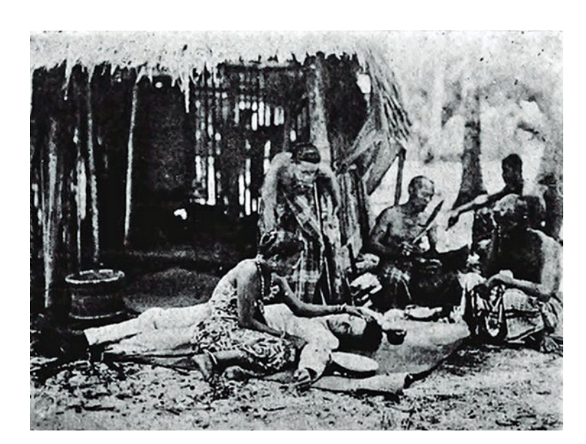
This still from Gaston Méliès' fiction film The Poisoned Darts is the only known scene from the film that was shot on location in Singapore. Filmed at "Passir Riz" (Pasir Ris), the non-Caucasian actors in the scene were likely Malay "natives" living in the kampongs in the area.

Méliès, noted that based on the surviving footage of this film, the actors were most likely inhabitants of Malay villages in Pasir Ris.<sup>9</sup>