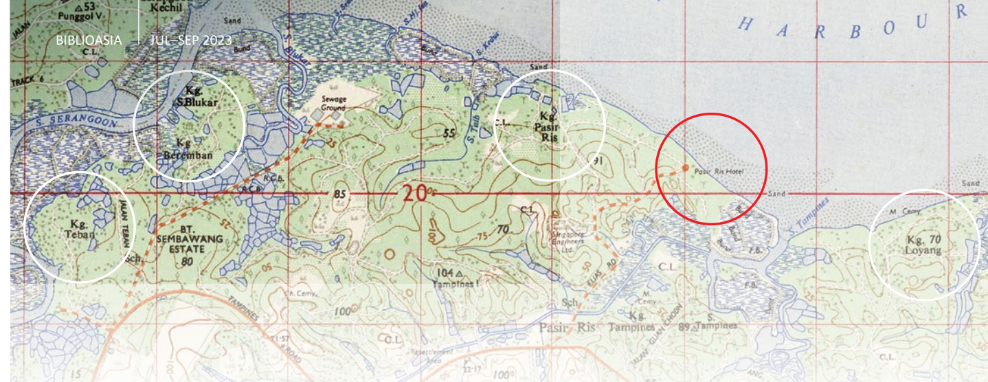
Detail from a 1961 topographic map showing Pasir Ris Hotel (circled in red) and the kampongs in Pasir Ris such as Kampong Loyang, Kampong Pasir Ris, Kampong Teban, Kampong Beremban and Kampong Sungei Blukar (circled in white). Singapore, 1961, TM001090, Singapore Land Authority Collection, courtesy of National Archives of Singapore.