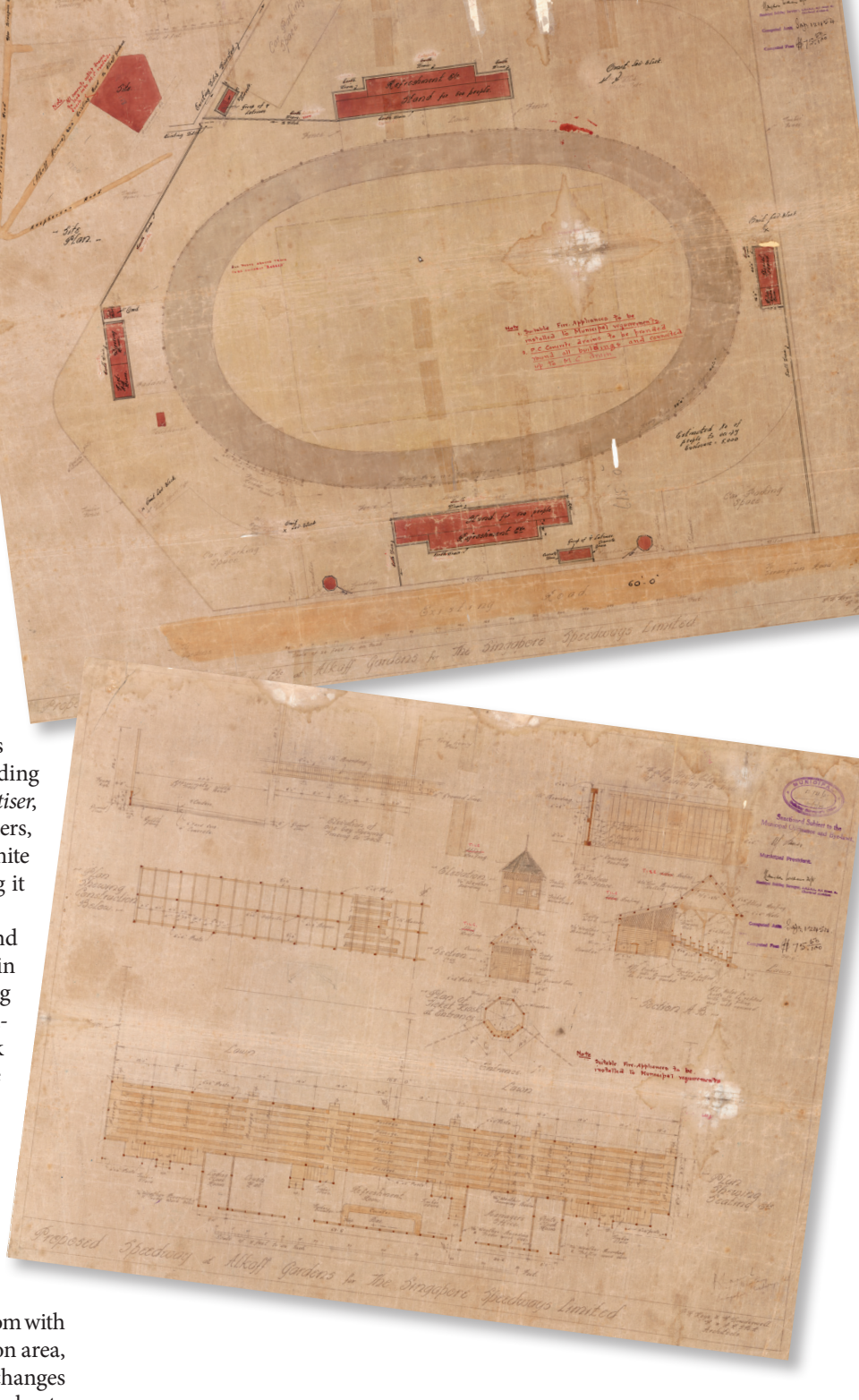
Original plans drafted by Keys & Dowdeswell in 1930 for the proposed Speedway.

The first was for the removal of a refreshment room with a bar counter, a "crush hall" or a foyer/reception area, and a manager's office from the design. The changes might have been made to lower costs and/or accelerate the project's completion. The second update was for additional seating along the racetrack.