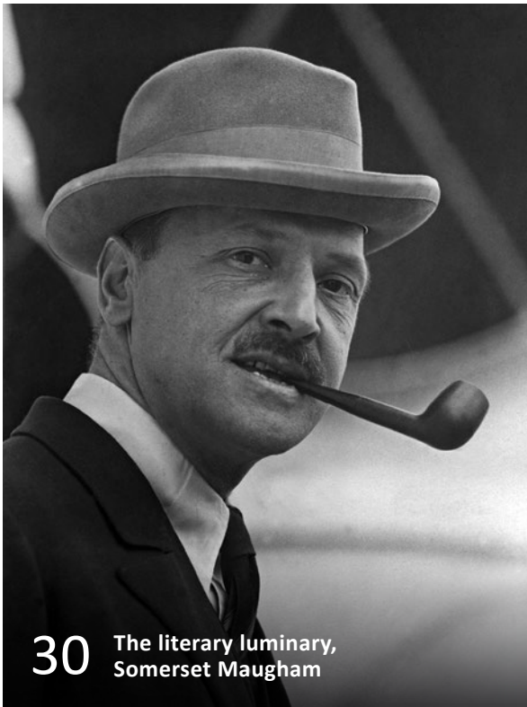
30 The literary luminary, Somerset Maugham