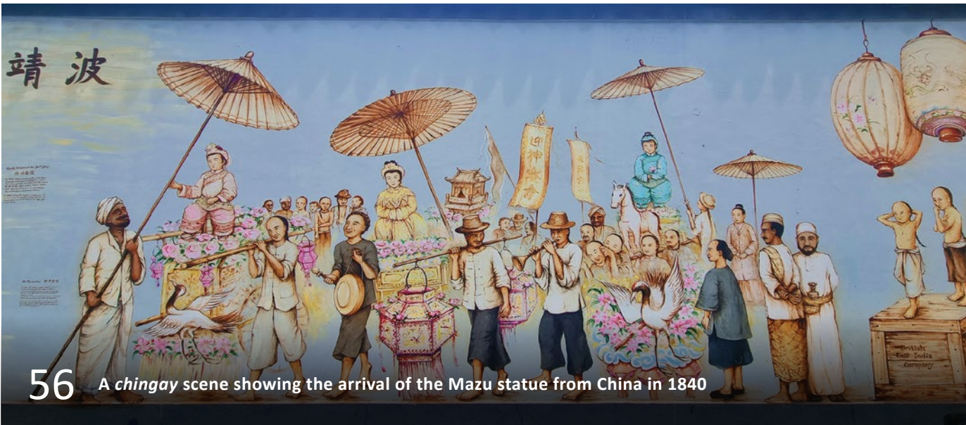
56 A chingay scene showing the arrival of the Mazu statue from China in 1840