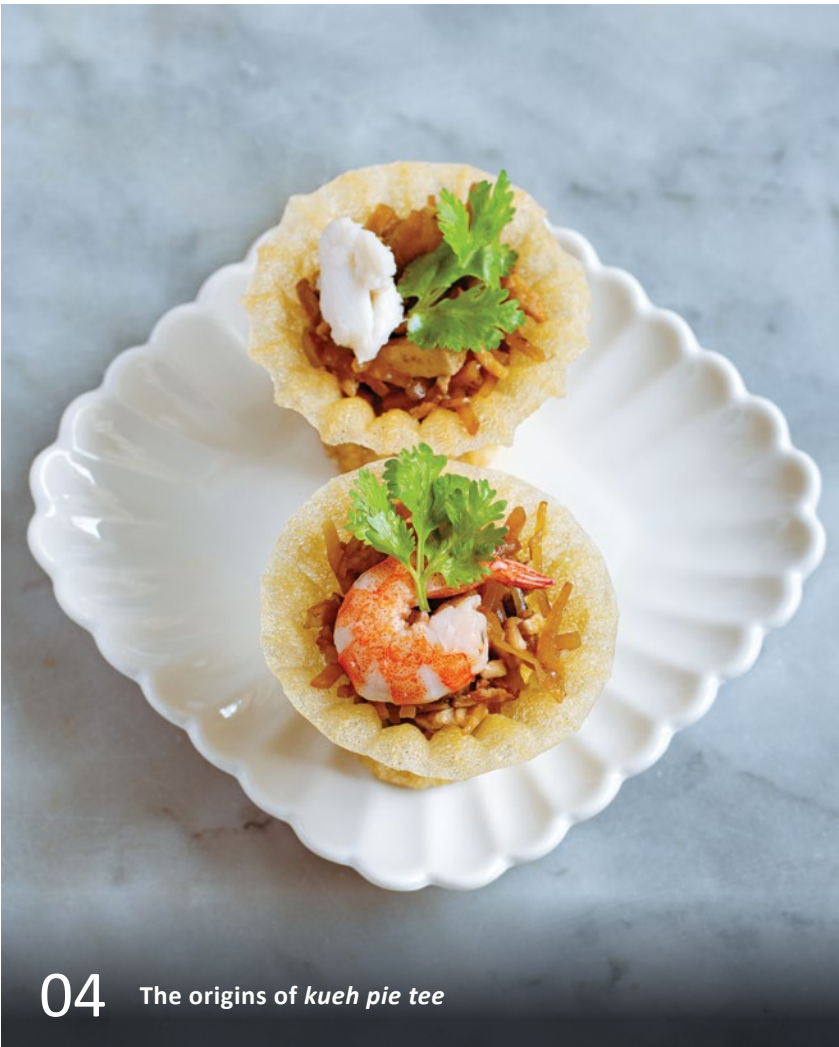
04 The origins of kueh pie tee