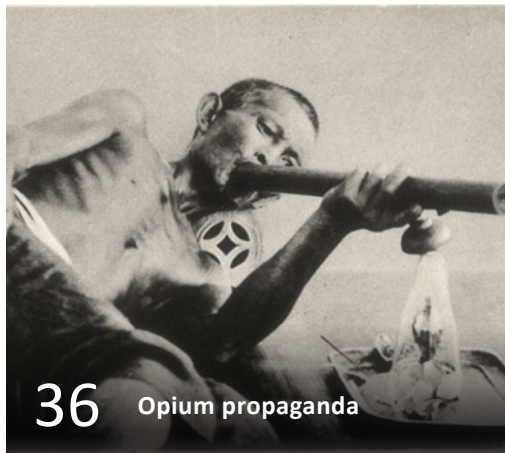
36 Opium propaganda