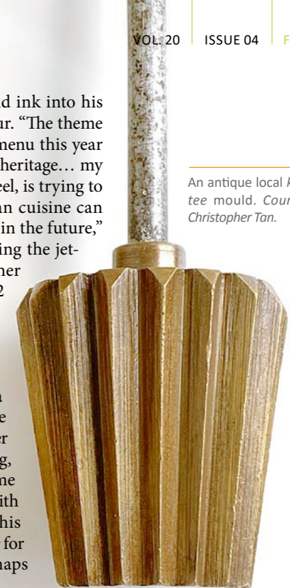
An antique local kueh pie tee mould.