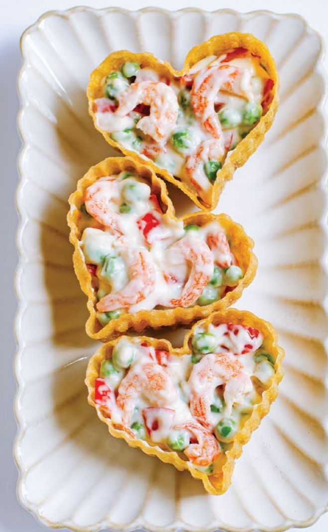
Christopher Tan's recreation of Sealtest Kitchen's creamed shrimp and peas in timbale cases.