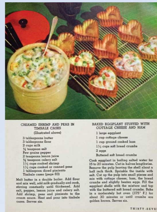
The recipe for "Creamed Shrimp and Peas in Timbale Cases" published in Sealtest Kitchen Recipes: World's Fair Edition (1939). Image reproduced from Sealtest Inc., Sealtest Kitchen Recipes: World's Fair Edition (New York: Sealtest Inc., 1939), 37.