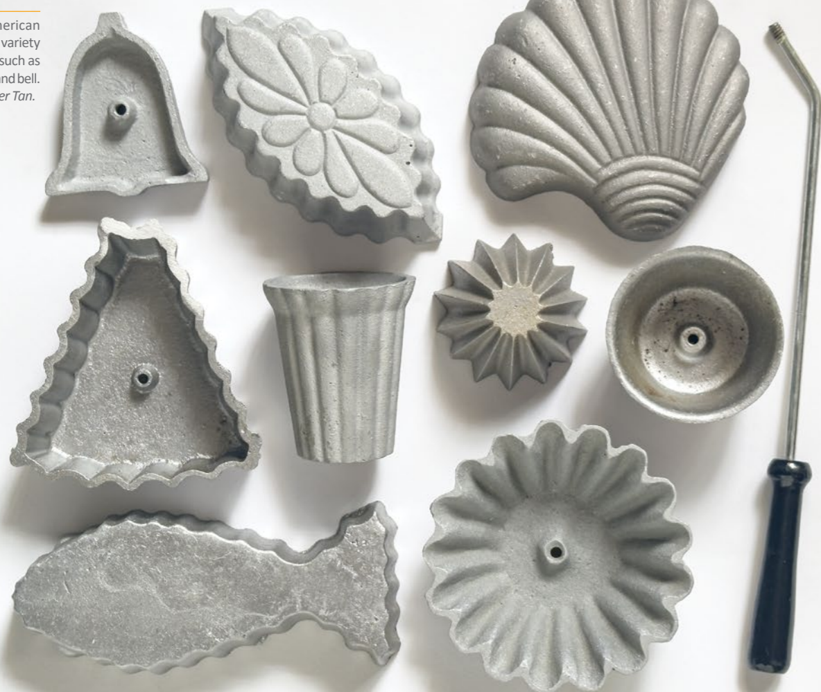
A set of vintage American patty iron moulds in a variety of decorative shapes such as leaf, flower, shell, fish and bell.

Food scholar Priscilla Mary Işın traces the technique further back, probably more than five centuries, to Turkey. She notes that in Eastern Turkey, families traditionally each possessed unique bespoke iron moulds to make fritters called demir