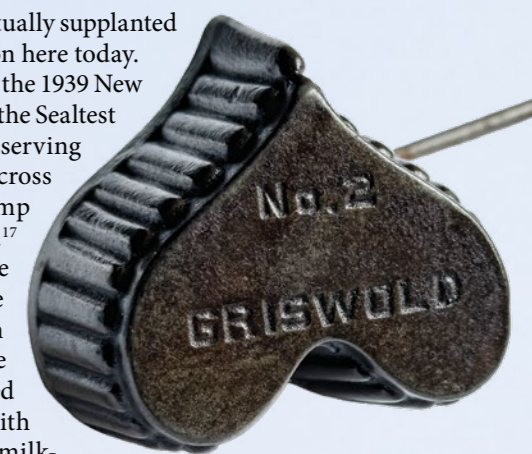
A vintage heart-shaped patty iron made by Griswold, a famous American ironware firm.

Similarly archetypal renditions did survive in some of Singapore's Western restaurants up until the 1990s. For instance, patty shells filled with chicken and mushrooms in white wine sauce were offered at Novotel Orchid Inn Hotel's Wienerwald restaurant in 1983, while in 1992, The Ship served shells cradling chicken à la King. 18