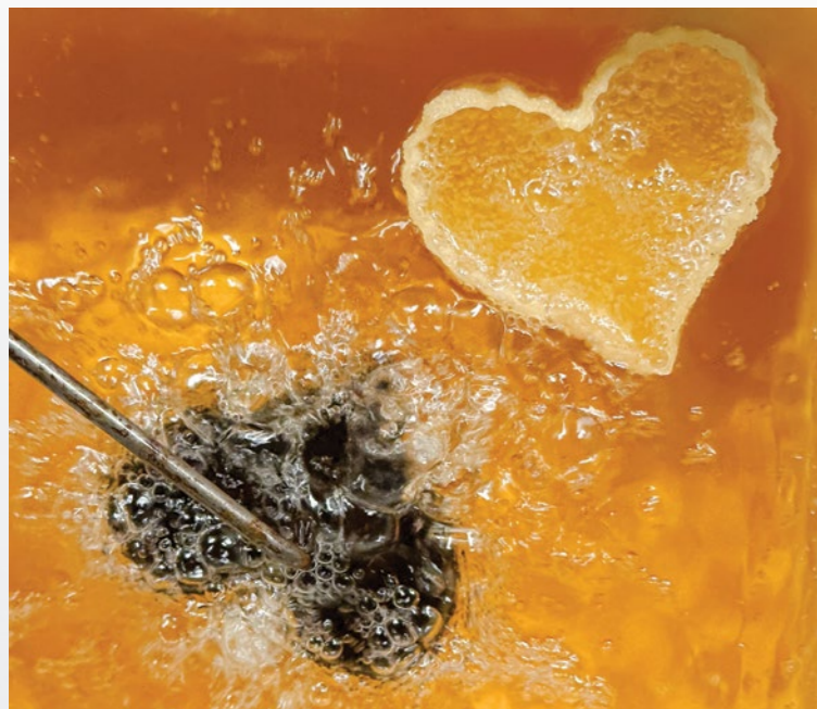
Frying a heart timbale case using the Griswold heart-shaped patty iron.

tatlısi. 8 The Erzurum region's blacksmiths were particularly famed for forging them: no other irons "hold the batter like an Erzurum iron" commented one author in 1900. 9 That area lies on the Silk Road, along which Işın surmises the recipe and moulds could have spread to the rest of the globe.