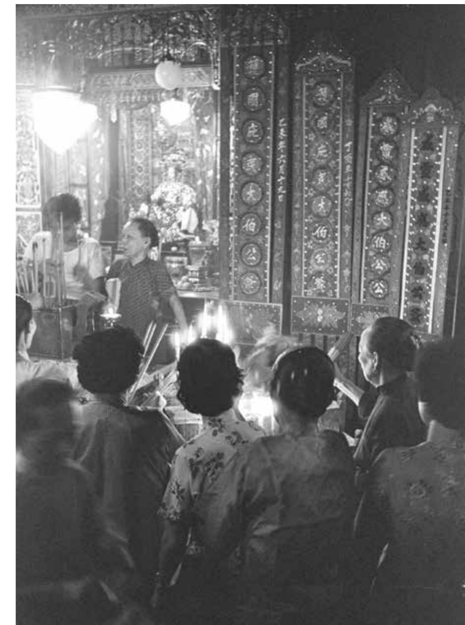
Devotees worshipping at Thian Hock Keng, 1965.