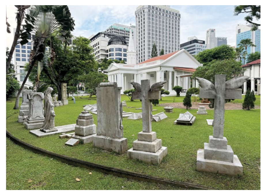
Tombstones of prominent Armenians in the Memorial Garden of the Armenian Church. The parsonage is located on the right.

The church trustees now had to balance this status with that of a consecrated space for the practice of Armenian Christianity. It was