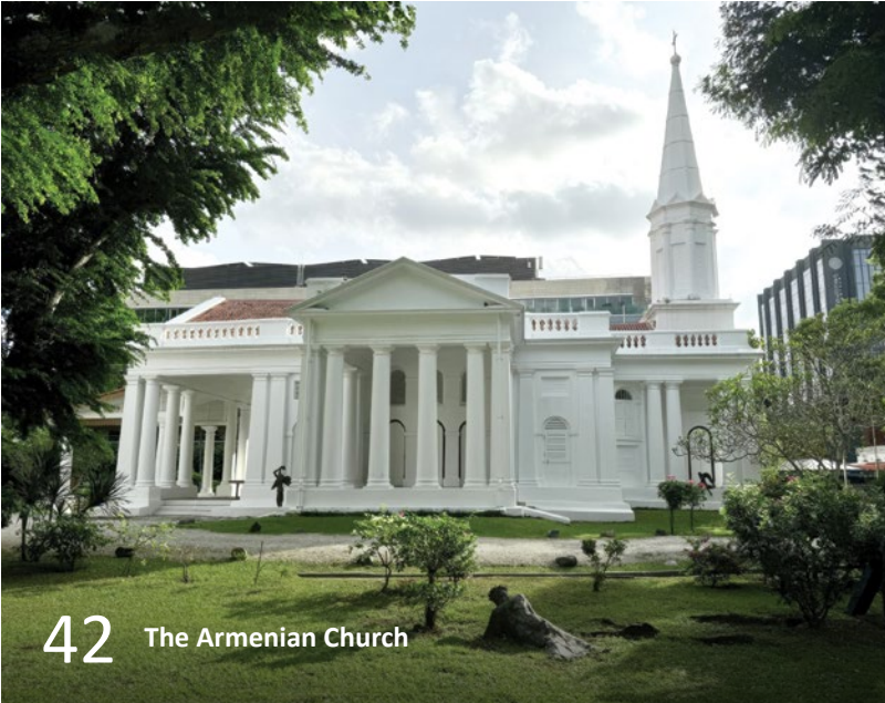
42 The Armenian Church