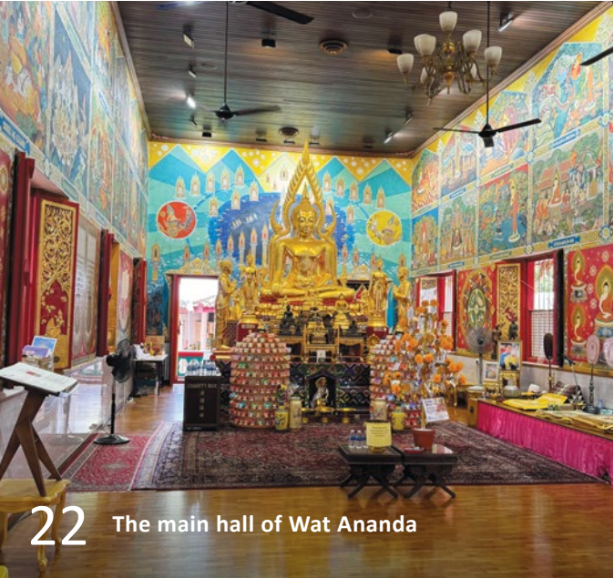
22 The main hall of Wat Ananda