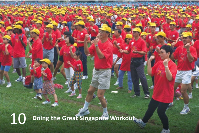
10 Doing the Great Singapore Workout