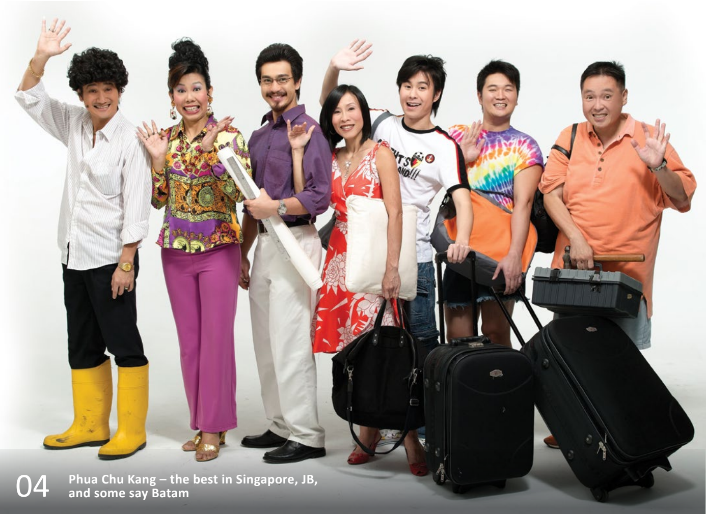
04 Phua Chu Kang – the best in Singapore, JB, and some say Batam