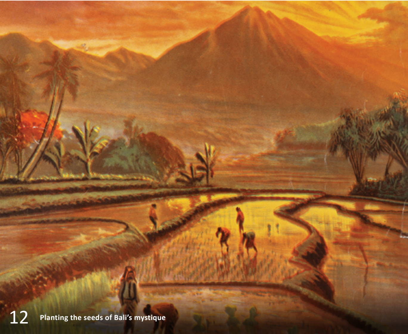
12 Planting the seeds of Bali's mystique