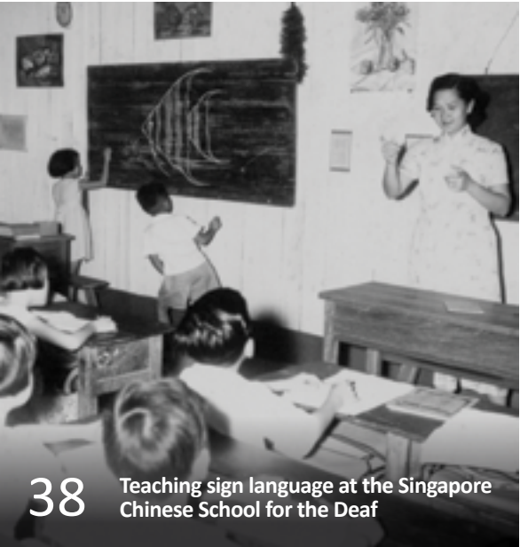
38 Teaching sign language at the Singapore Chinese School for the Deaf