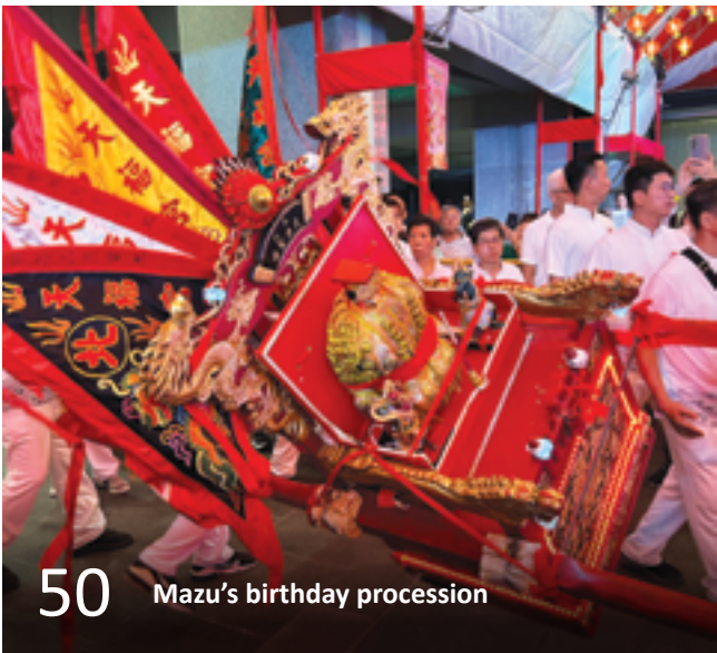
50 Mazu's birthday procession