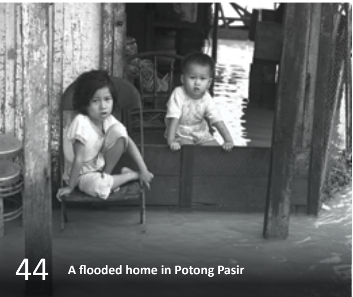
44 A flooded home in Potong Pasir