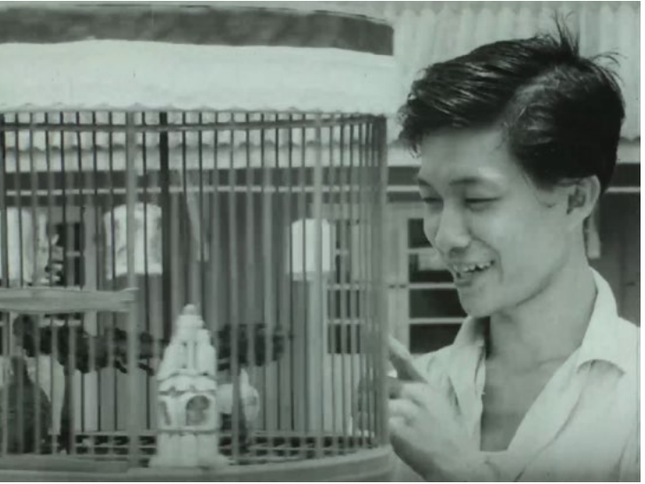
(Top) A Berita Singapura film was screened at the Capitol with the movie, Mission to Del Cobre.

(Above) A screen grab from the annual bird singing competition at Jubilee Malay School, 1963.