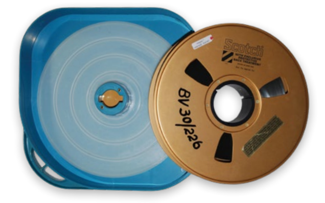
A two-inch quadruplex tape weighing 5.5 kg per tape.

A significant change came in 1967 when the Curriculum Development Institute of Singapore pioneered the use of two-inch quadruplex videotapes<sup>22</sup> for educational programming, marking Singapore's first steps into the video age. From 1967 to the 1980s, educational television programmes complemented classroom teaching and textbook learning.