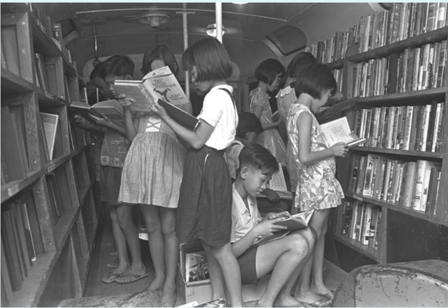
Children reading inside the mobile library van at the opening of the mobile library service point at Paya Lebar Community Centre, 1967.

In 1973, because of government efforts to curb inflation and to manage the global energy crisis, the National Library was tasked with evaluating the efficiency of its mobile library service. The goal was to potentially reduce or relocate the existing 12 service points. The relocation of the Library Extension Services section to Toa Payoh Branch Library also provided an opportunity to streamline mobile library operations. Consequently, in 1974, three service points – Pasir Panjang, Changi 10 milestone and Serangoon Gardens – were shut down. 36