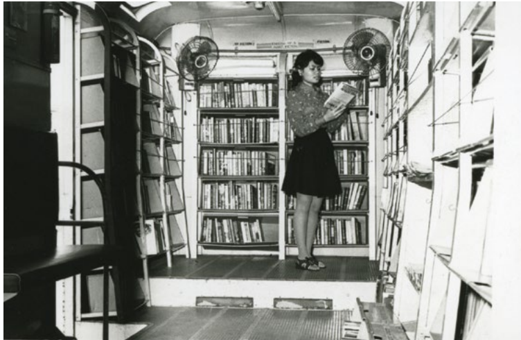
The interior of the mobile library bus, 1975.

Under this strategic shift, no new mobile service points were added except for Ang Mo Kio where a mobile library service point was established to provide interim services until the completion of the Ang Mo Kio Branch Library. On 14 January 1991, the mobile library service, along with its six remaining service points at Choa Chu Kang, Nee Soon, Punggol, Changkat, Tanjong Pagar and Woodlands, ceased operations after 26 years of service. 38