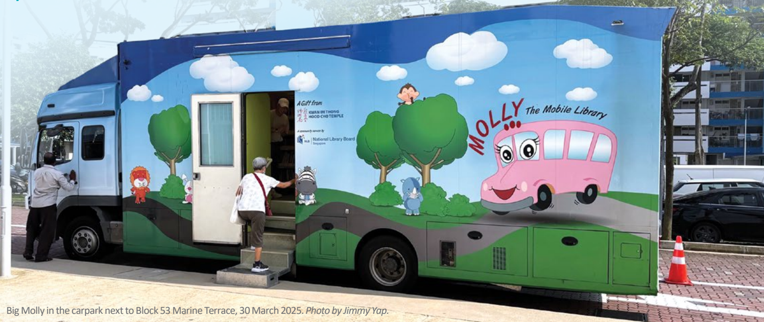
Big Molly in the carpark next to Block 53 Marine Terrace, 30 March 2025.

On 31 January 1959, the Singapore Constitution Exposition opened at the former Kallang Airport to much fanfare. The two-month-long event was organised to celebrate the establishment of the State of Singapore and the new Constitution, a major milestone in Singapore's transition to full internal self-government. 1