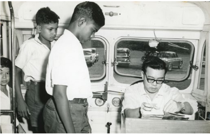
Borrowing books in the mobile library van, 1962.

collection. This donation funded the purchase of 23,519 books in 1966 for the two unused book trailers, facilitating the service’s expansion. 20