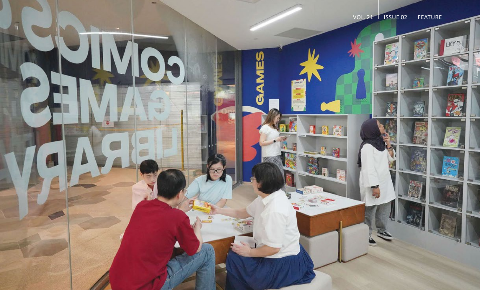
Nodes provide reading and learning experiences beyond the physical libraries. Shown here is the Comics & Games Library at Punggol Coast Mall developed in partnership with JTC and local board games company Origame. The pop-up library features a collection of more than 7,000 comics, game-themed reads, graphic novels and board games.

between “library spaces” and “non-library spaces”, but the libraries of the future ought to blur that line. One way that NLB has tried to do this is with Nodes, which bring library services into spaces that are not traditionally “library spaces”, like offices, cafés and even public transport. 2 Beyond that, I think we can also blur these lines within our libraries.