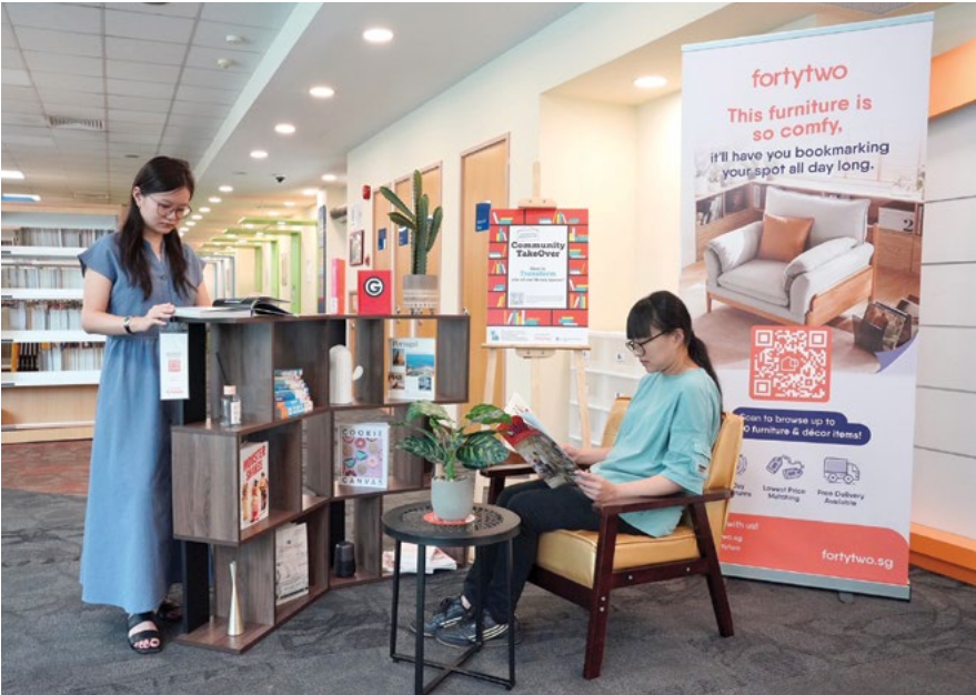
As part of community takeover, the National Library Board partnered with homegrown furniture brands to reimagine reading spaces and offer library patrons a new reading experience. Pictured here is the Jurong West Public Library in partnership with FortyTwo.

People today want stories that they know are true, that are documented in enough detail to bring them to life, and that are connected to their personal identities and everyday realities. The resources that the National Library and National Archives have so carefully collected and preserved can offer our patrons all these things and, when brought to life in exciting and interactive ways, provide patrons with not only a fun experience but also a deep and meaningful connection to their nation and its history.