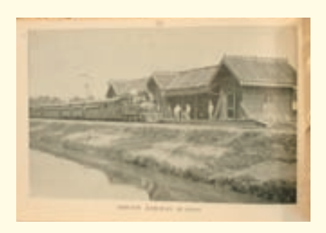
Picture of Newton Railway Station from Souvenir of Singapore: A Descriptive and Illustrated Guide Book of Singapore. All Rights Reserved, The Straits Times Press, 1905.

The Rare Materials Collection is a historical collection that reveals much of how Singapore, after its founding, grew into a leading port and its development from a colony to a sovereign nation. Researching into this wealth of information should help our generation to better appreciate their heritage and understand the present state of being.