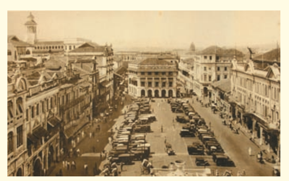
Scene of Raffles Square in the 1920s from Sunny Singapore . All Rights Reserved, Kelly & Walsh, [192-].

The collection also contains titles, which depict the old scenes and landscapes of Singapore. Published in the 1920s in Singapore, the book Sunny Singapore illustrates the scenery and images of Singapore, which are now non-existent. The book is testimony to the changes and developments that Singapore has gone through.