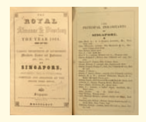
Pages from the Singapore Almanack and Directory.

The directory entitled Singapore Almanack and Directory is an excellent source of references if research is being done on past residents of Singapore. First published in 1846 and popularly called the Straits Directory, this is the earliest Singapore directory. It lists the names and addresses of residents on the island as well as their professions. It also includes brief information on Singapore.