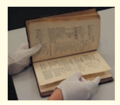
Gloves are used when handling Rare Materials

Due to preservation purposes, all titles in the Rare Materials Collection are microfilmed and some digitised. Originals are no longer handled, as frequent handling will hasten their wear and tear. If the materials are ever handled for maintenance purposes, it is done so with gloved hands.