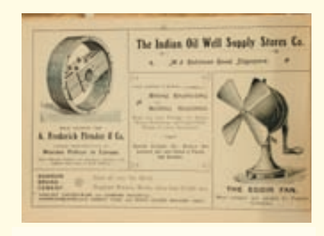
Advertisement page from Souvenir of Singapore: A Descriptive and Illustrated Guide Book of Singapore. All Rights Reserved, The Straits Times Press, 1905.