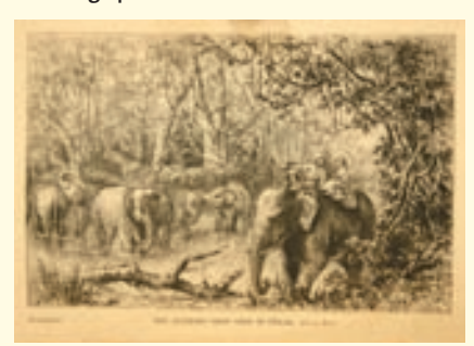
"The Author's First Ride in Perak" from the book The Golden Chersonese and the Way Thither.

One fascinating book is The Golden Chersonese and the Way Thither , written by the famous woman traveller of that time, Isabella Bird. Published in 1883, it contains her descriptions and observations of the places she visited, which included the Far East and the Malay Peninsula, including Singapore. The book is a compilation of letters she wrote to her sister, and describes amongst others, local manners and customs and the flora and fauna of the places she visited as well as the growth of Singapore.