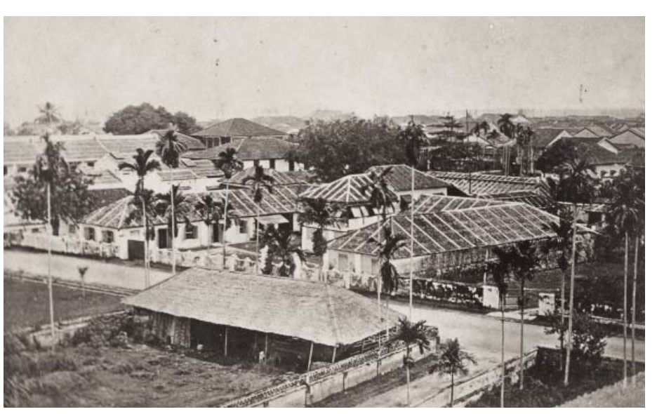
When the first Indian convicts arrived in Singapore in 1825, they were put up in convict houses located between Bras Basah and Stamford roads. Ironically, the convicts were made to build their own prison complex; work began on the Bras Basah convict jail in the 1840s and it would take some 20 years to complete.

bricks. So superb was their craftsmanship in both making and laying bricks that their work was awarded a silver medal at the Agra Exhibition held in India in 1867. The convicts' creativity was also seen in the rattan chaise lounge they designed and which soon became widely used throughout the Far East.