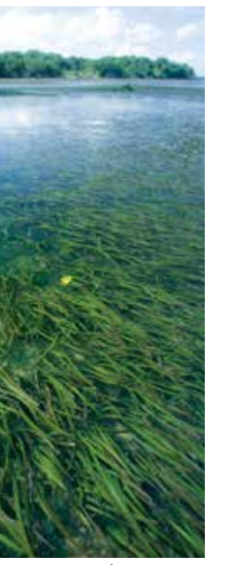
(Above) Smooth ribbon seagrass (Cymodocea rotundata) growing in abundance at the seagrass lagoon at Chek Jawa. (Right) High tide at the Chek Jawa boardwalk.