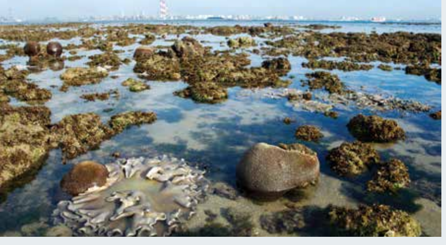
The living reefs of Cyrene Shoal, off the southwestern coast of Singapore. Photo taken by Ria Tan on 22 March 2007. Courtesy of WildSingapore .

Pulo Pandan presents for historians and cartographers, if not a shifting