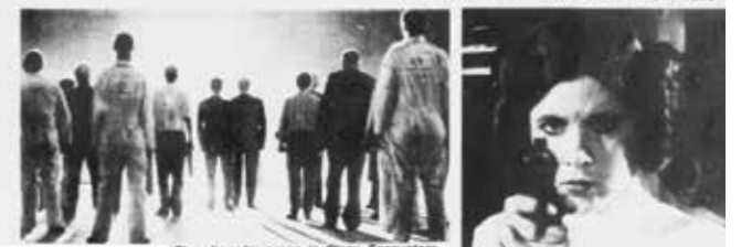
The climactic scene in Close Encounters of the Third Kind .

LEADING THE PACT IS 'STAR WAR' — THE SPECTACULAR THAT WILL SWALLOW MORE MONEY THAN 'JAWS' DID