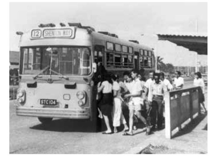
[Below] The scene at a bus stop before the queue campaign by the Singapore Traction Company, 1960s.

"The picture as presented during 1972... Everywhere the traveller went there were breakdowns: a broken down bus did little to assist the concept of the "green" city... the conductor was required to remove a seat cushion to place some distance behind the failed bus, adding a branch of a tree to act as an additional marker. The