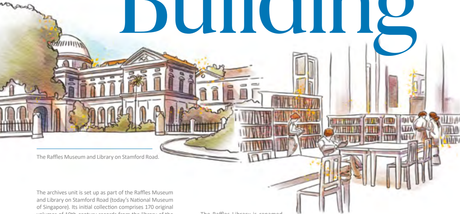
The Raffles Museum and Library on Stamford Road.

The archives unit is set up as part of the Raffles Museum and Library on Stamford Road (today's National Museum of Singapore). Its initial collection comprises 170 original volumes of 19th-century records from the library of the Colonial Secretary. This collection, later named the Straits Settlements Records, documents the history of British administration in Singapore, Penang and Malacca.