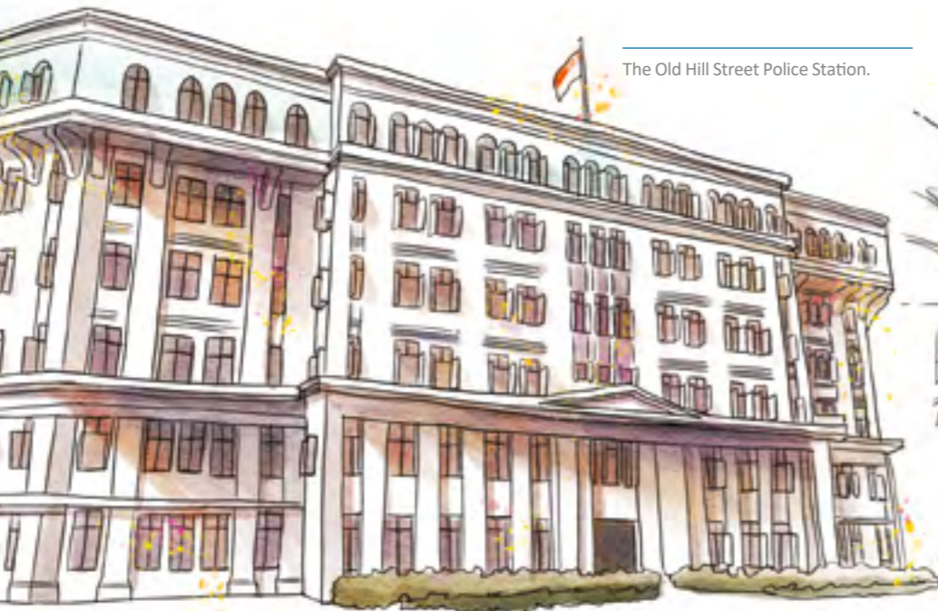
The Old Hill Street Police Station.