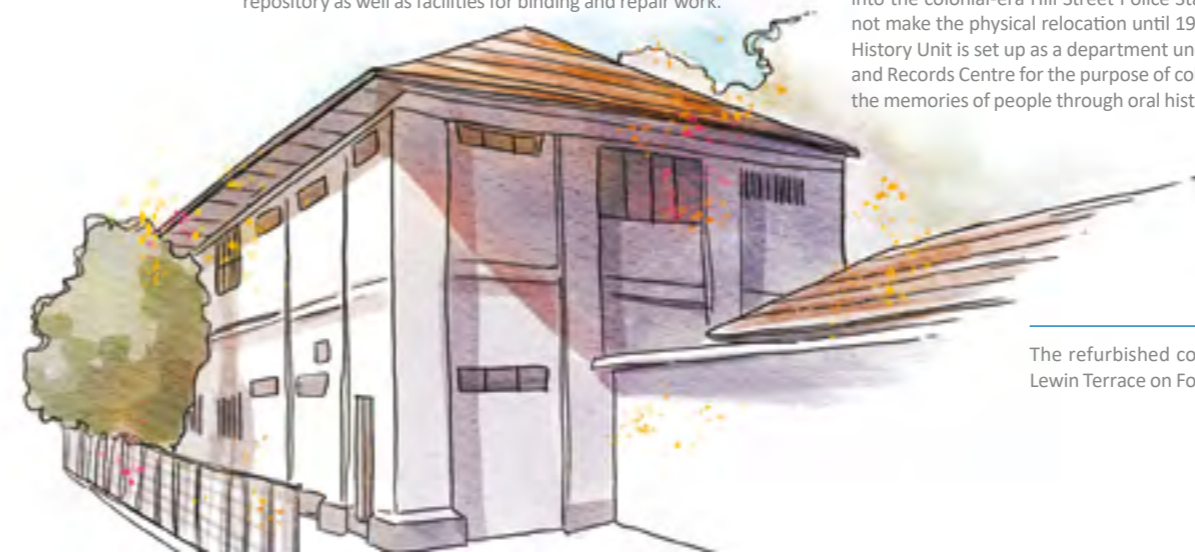
The refurbished colonial buildings at 17-18 Lewin Terrace on Fort Canning Hill.