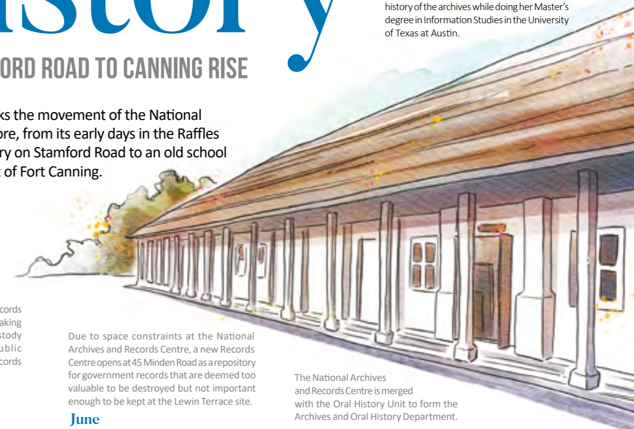
The new Records Centre at 45 Minden Road.