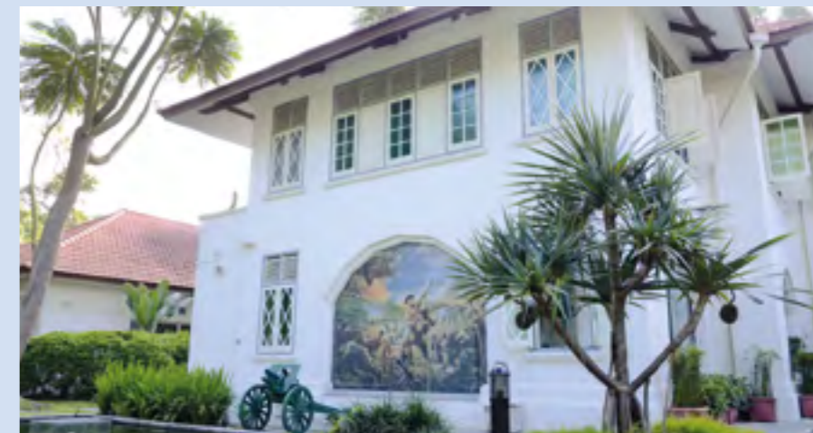
Reflections at Bukit Chandu on Pepys Road.

The NAS becomes an institution under the National Library Board.