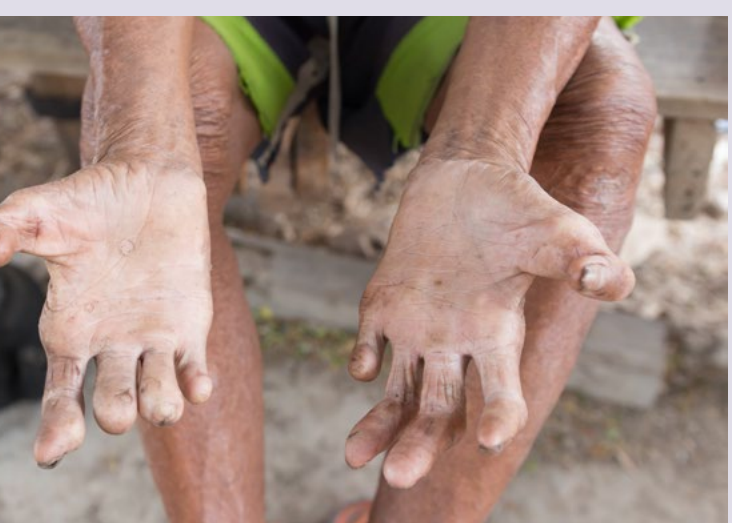
If left untreated, leprosy is a debilitating and disfiguring disease that causes intense pain to sufferers as the disease progresses. It affects the nerves, skin, eyes and respiratory tract. The nerve damage can result in the crippling of hands and feet, with fingers and toes sometimes requiring amputation.

"I was in charge of the youth club in Trafalgar... the mother came crying with the child. She said the neighbours know.