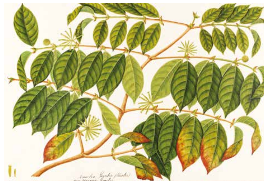
A painting of the gambier plant from the William Farquhar Collection of Natural History Drawings, 1803–18. Gift of G.K. Goh.

for plantations. Farquhar further reported that some 20 plantations were already present in Singapore when he first arrived with Raffles in 1819.<sup>7</sup>