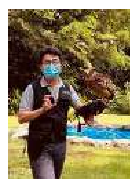
(Right) The Kings of the Skies Show featuring majestic birds of prey is a favourite with visitors. Shown here is the Malay fish owl which catches prey with its strong and steady talons.

The new and improved bird park will include themed walk-through aviaries designed after different regions and ecosystems of the world - stretching from the rainforests of Africa to the bushlands of Australia – allowing visitors to immerse themselves in the naturalistic habitats of