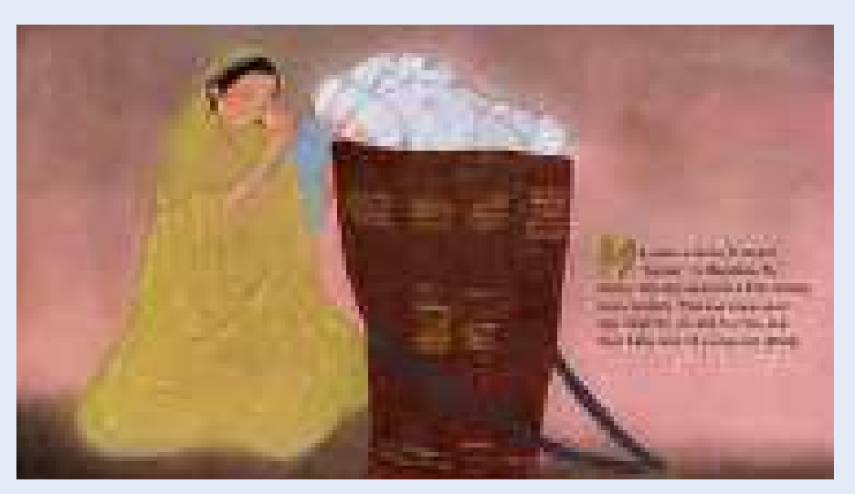
Told from the perspective of a basket, I, Doko, depicts the significance of filial love in this poignant Nepalese folktale by Ed Young. Young, E. (2004), I, Doko: The Tale of a Basket. New York: Philomel Books. Asian Children's Literature Collection, National Library, Singapore. (Call no.: RAC 813.54 YOU).

for decades, the moral of the story is to treat old people with respect and deference even when they are ailing and are no longer "useful".