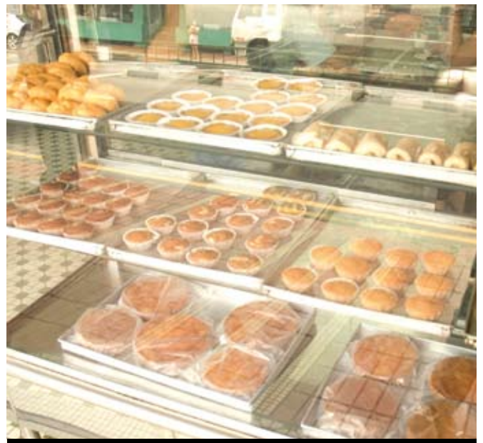
The coffee shop boasts a delectable spread of Peranakan, Serani and Western colonial community-influenced cakes and pastries that are special to the Joo Chiat area.

Singapore and Southeast Asia is to actively document "heritage" in the making.