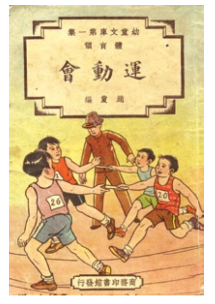
Rules and regulations for sports meets. All rights reserved, The Commercial Press (Shanghai), 1948.

Despite the minimal training and supervision