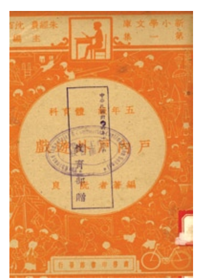
Lesson plans for indoor and outdoor games. All rights reserved, The Commercial Press (Shanghai), 1947.

One of the practices started by the new Superintendent of Physical Education was to have all government schools follow the syllabus of physical education as used in England (SSAR, 1935, p. 216). This was to correct the discrepancies he observed in the standard of work among different classes in schools (SSAR, 1925, p.216). However, as he had split his attention among the schools of the Straits Settlements, progress on this front was slow. Nevertheless, he was able to introduce a new physical education textbook, "Kitab Senam" (Ibid, p. 224), to all government Malay schools.