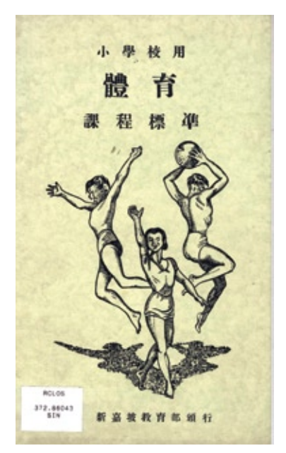
Syllabus for physical education for all primary schools in Chinese. All rights reserved, Ministry of Education, 1959.

The government and the Chinese schools started the first Combined School Sports Meet in 1936. More than a