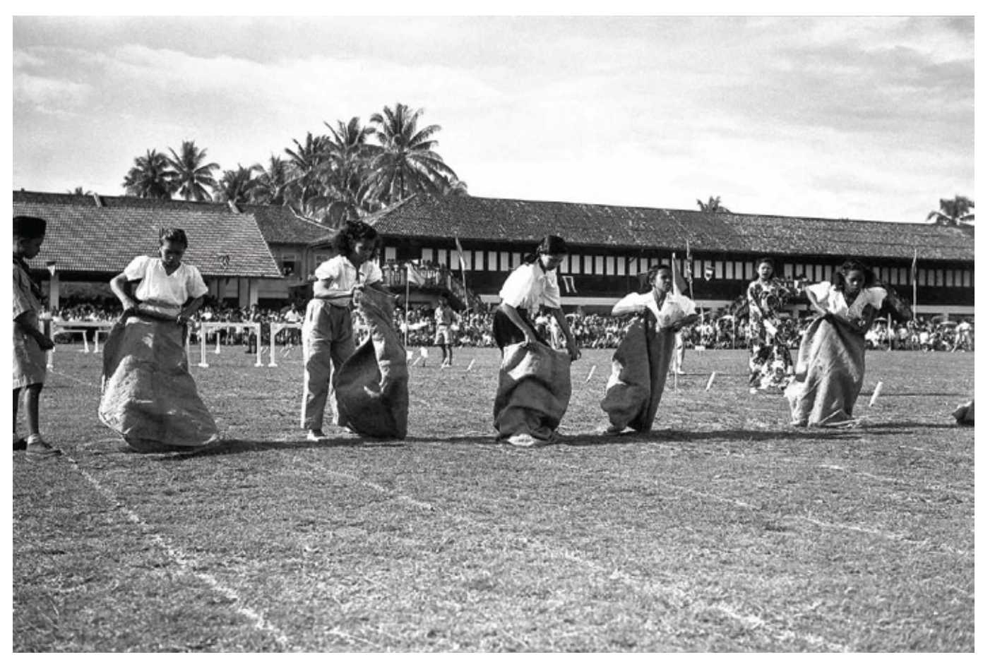
A sports day at Malay Girls' School (1950).