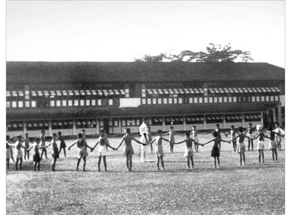
Pupils from Bukit Panjang Government School attending a Physical Education (PE) lesson (1950).

schools were organised in the colonial days, when most schools were administered by the private sector and the government operated only a handful of English and several dozen Malay schools. By and large, there were mainly two branches of education: English medium schools (Lun, p. 3) and vernacular schools where students were instructed in the vernacular languages of Malay, Chinese or Tamil. While the English schools were mainly the concern of the government and Christian missions, the private sphere administered the vernacular schools, with the exception of government Malay schools. Under this variegated system of schools, there was no central body overseeing the general development of physical education in schools and, as a result, disparities occurred among the various branches of schools then. In the early days, "gymnastics" or "hygiene" was considered physical education (Koh, p. 4).