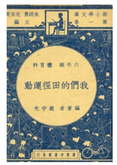
Lesson plans for track and field sports.

provided, the range of sports played in schools expanded to include boxing. The sport was played in Outram School and St. Andrew's School, and the two schools played against