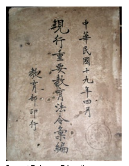
Current Rules on Education. All rights reserved, Ministry of Education, China, 1930.