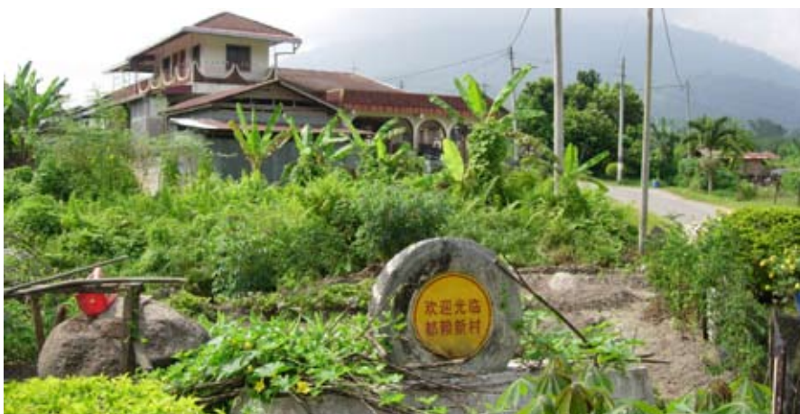
"Welcome to Tras New Village". The sign at the entrance of Tras today.

In the context of the emergency, the history of Tras is illustrative of an extreme set of circumstances. The assassination of the High Commissioner not only altered Tras' historical trajectory; the mass detention and collective punishment further displaced and dispersed the Hakka community in Malaya. The Tras people bore the heavy costs of this tragic event,