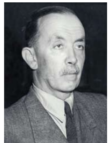
British High Commissioner in Malaya (1948-51), Sir Henry Gurney.

This study adopts a "history from below" perspective to document the social experience of resettlement and life behind the barbed wire fences for the residents in the New Villages. It re-examines and analyses how the assassination of the British High Commissioner to Malaya in 1951 both implicated and changed the lives of Tras New Villagers during the Emergency period. By examining the experiences of Tras New Villagers through oral accounts and interviews, this micro-level study brings attention to the significant impact of the Emergency, including the displacement and forced relocation of this particular rural Chinese community.