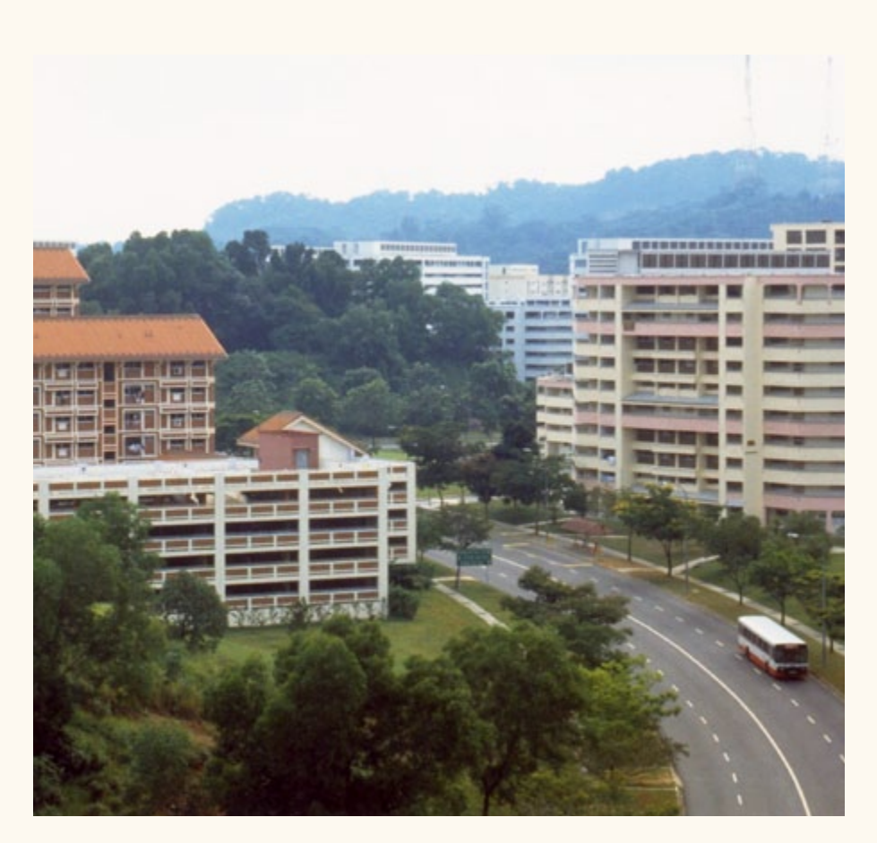
Bukit Batok housing estate with HDB flats in the foreground, and the transmitting station in the background.

...is a sensitive portrayal of how the fast-changing landscapes in Singapore underpin the social, political and economic values that frame our nation-state's rapid growth during the post-independence years. This fourpart poem personifies the familiar landmark as a "Time-traveller; master of winds..." in its imposing geology, its cultural significance as a village in the chaotic period during the Japanese