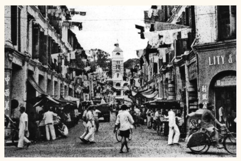
Hock Lam Street with the Central Fire Station in the background, 1950s.

The passage of time is marked by our changing city. Singapore's journey from kampongs, to multi-storeyed public housing, from old "mama" shops to massive shopping malls showcases our past, present and hopes for the future. Most Singaporeans have seen these changes happen throughout their lifetime. Ironically, this rapid change has given rise to a groundswell of nostalgia in all sorts of ways - many shops, homes, cafes and hotel spaces now boast retro interior design (a choice vintage sofa here, an old-fashioned typewriter there); fashion is part of this rising trend (as seen in how the 1960s style made a comeback in renewed forms). "Nostalgia is likely when social change is rapid enough to be detectable in one lifetime at the same time,