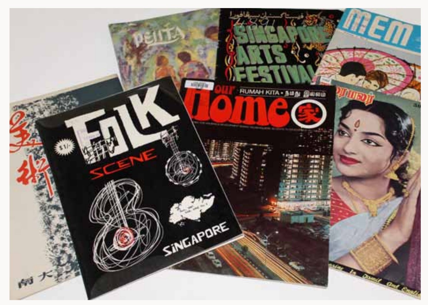
Magazines have come a long way from these early issues published in Singapore. All rights reserved. National Library Board, 2012.

Female is another magazine that is still loved and enjoyed by women in Singapore today. The very colourful first issue contains interesting features on health, the vibrant styles of the 1970s, a beautiful home in Frankel Estate, and articles on motherhood and issues of working women.