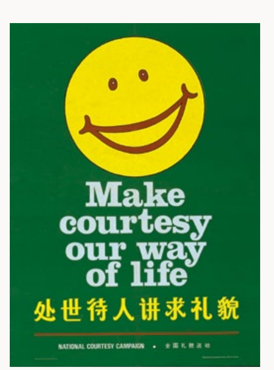
The face of the courtesy campaign was originally Smiley before Singa the Courtesy Lion took over in 1982.

and had the slogan "Make Courtesy Our Way of Life". This was subsequently replaced by Singa the Courtesy Lion mascot in 1982.<sup>10</sup>