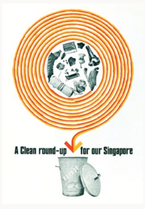
A poster encouraging Singaporeans to keep their surroundings clean.

For instance, many of the older campaigns have been consolidated into larger ones to reduce the number of campaigns run annually. Furthermore, the private sector was encouraged to initiate and front some of the newer and existing campaigns. This was to give campaigns a less top-down approach, making them less intrusive and more judicious to the public. Even with these changes, it is certain that campaigns will continue to be an integral part of the social fabric of Singapore society, thus making campaigns truly a way of life for Singaporeans.